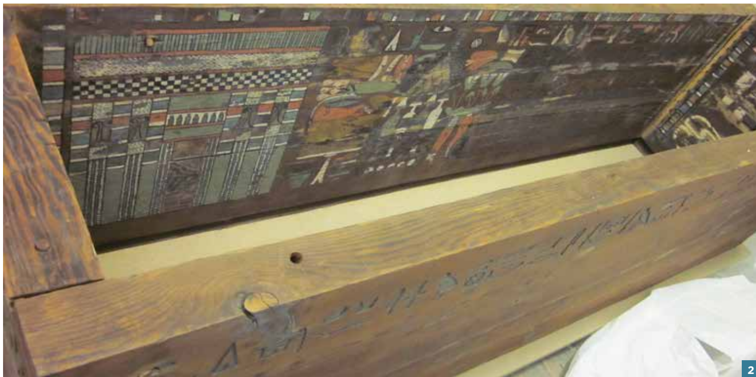
2 PAINTED INTERIOR OF THE COFFIN SHOWING DETAIL OF OFFERINGS AND ELABORATE DOOR (FEBRUARY 2014).