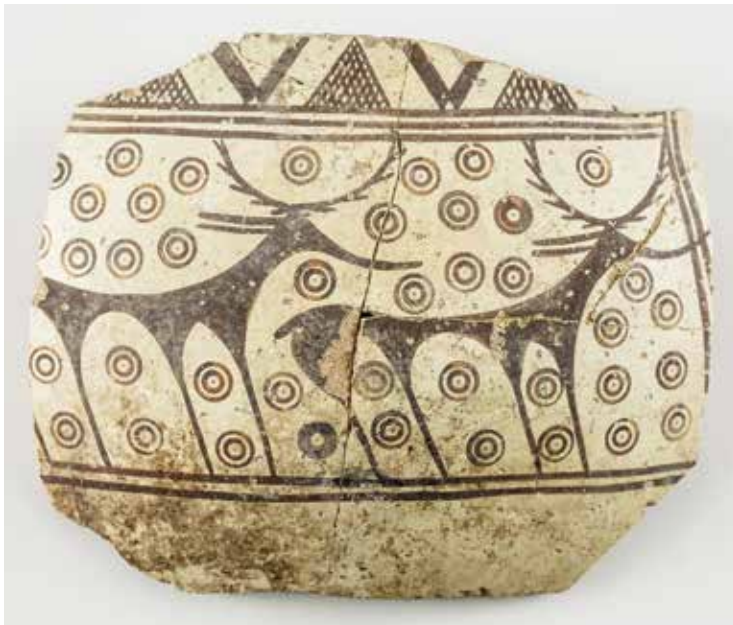
Overleaf: Sherd with Stags. Alişar Höyük, Turkey. Iron Age II, ca. 1000-700 BC. Syro-Anatolian Collection. A10266 (D. 19193)