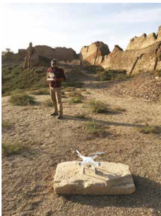
Figure 2. Grégory Marouard using a drone DJI Phantom 4 at Dendara

He also submitted for the fall 2017 issue of the Oriental Institute News & Notes , a short notice on the use of drone and photogram-