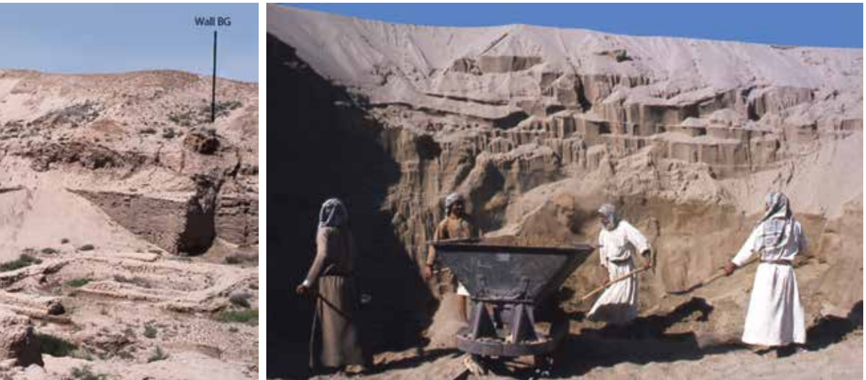
FAR LEFT: WA with dune looming over it and hiding a villa. 1974, taken from northeast. MIDDLE: Nippur Villa with a Court of Columns high up above Area WA, 1992, from southeast. Much of the dune has dropped into Area WA, where the Gula Temple lies. ABOVE: Removing sand from WA.

WA, I was surprised to see that the blowing away of the great dune that hung over Area WA had left exposed the rounded baked-brick pillars of the “court of columns,” which was a feature of a huge Parthian villa that Penn had dug in the 1890s. I had seen these columns when I was first at Nippur as a student archaeologist in 1964. I did not take a photo of them at that time, and when I took over direction of Nippur in 1972 and opened Area WA, the dune had completely hidden them. Because I knew that the court was in this area, I mistakenly thought that a small area with a few baked bricks, which was located to the northeast and about 6 m lower in the mound, was all that was left of the court.