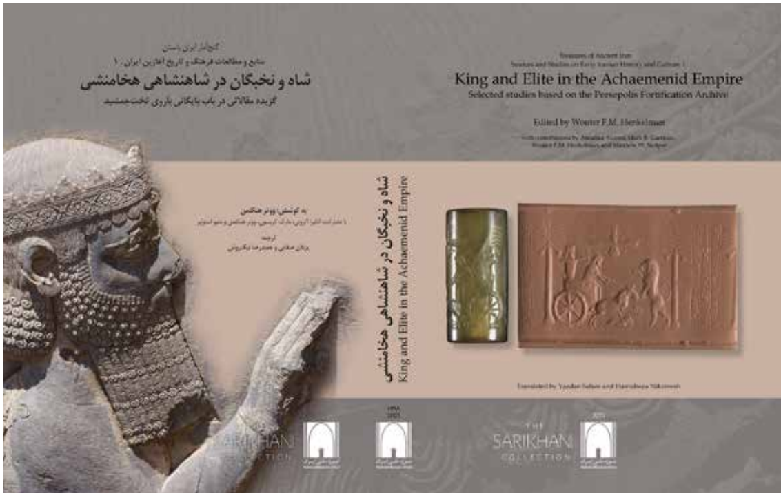
Figure 5. Cover of Šāh va nokhbeḡān dar šāhanšāhī-ye Hakhāmanešī ( King and Elite in the Achaemenid Empire , Henkelman 2021b), with Fārsī translations of studies by PFA Project editors.

animate beings, but scribes at Persepolis itself marked them as inanimate, thus hinting at both professional and social differences. 6