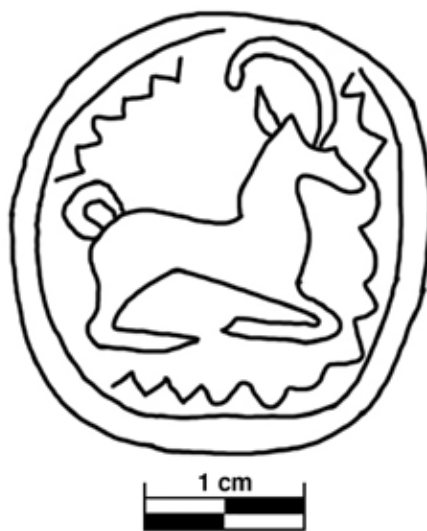
FIGURE 4. Stamp seal PFUTS 0595s, impressed on uninscribed Fortification tablets, showing a crouching goat or ibex with sweeping horns and an elongated body. Drawing by Delphine Poinsot.

In another vein, looking at how the documents are written leads to insights about the people who produced the documents. Considering the syllabary of the Elamite Fortification texts, I concluded that at least some of the writers of the texts were conversant with a larger repertoire of the Mesopotamian syllabary than they ordinarily used to produce receipts, accounts, and tables 5 ; to paraphrase Dr. Spock, they knew more than we think they did. Henkelman, considering the use of determinatives (that is, signs used as semantic classifiers rather than as representations of syllables), observed that scribes in the settlements around Persepolis tended to mark the months of the Achaemenid calendar grammatically as