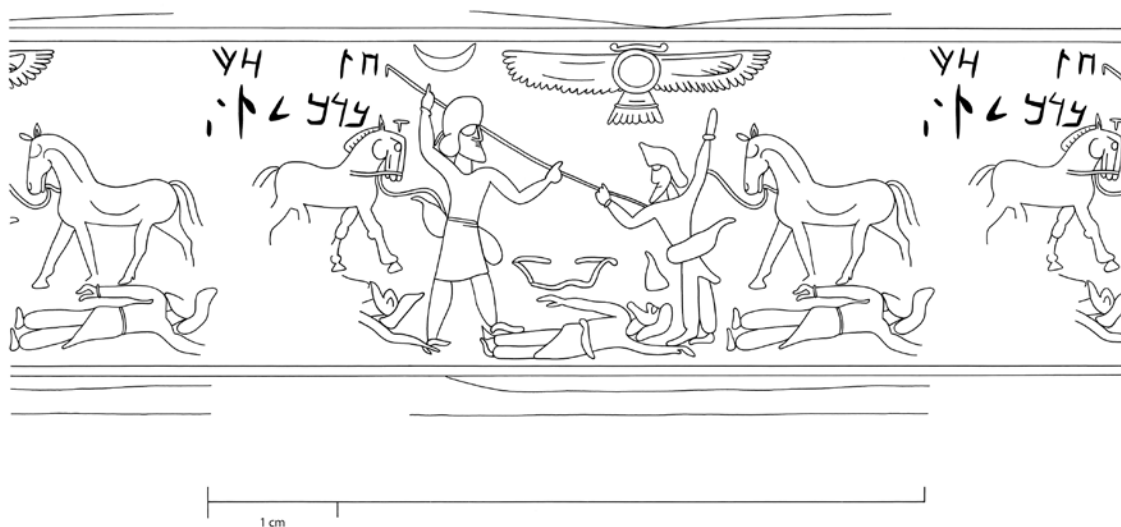
FIGURE 3. Collated drawing of the inscribed seal of Aršāma, PFS 2899*, by Mark B. Garrison.

of the largest thematic groups in the PFA seal corpus, more than four hundred items—that is, about one in ten of the seals cataloged until now (fig. 4).