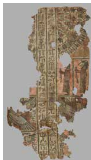
Shroud OIM E4789.

Gaudard has been working on various articles, including the following: