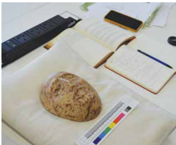
The Er-Ram Mask in the Palestine Exploration Fund collection.