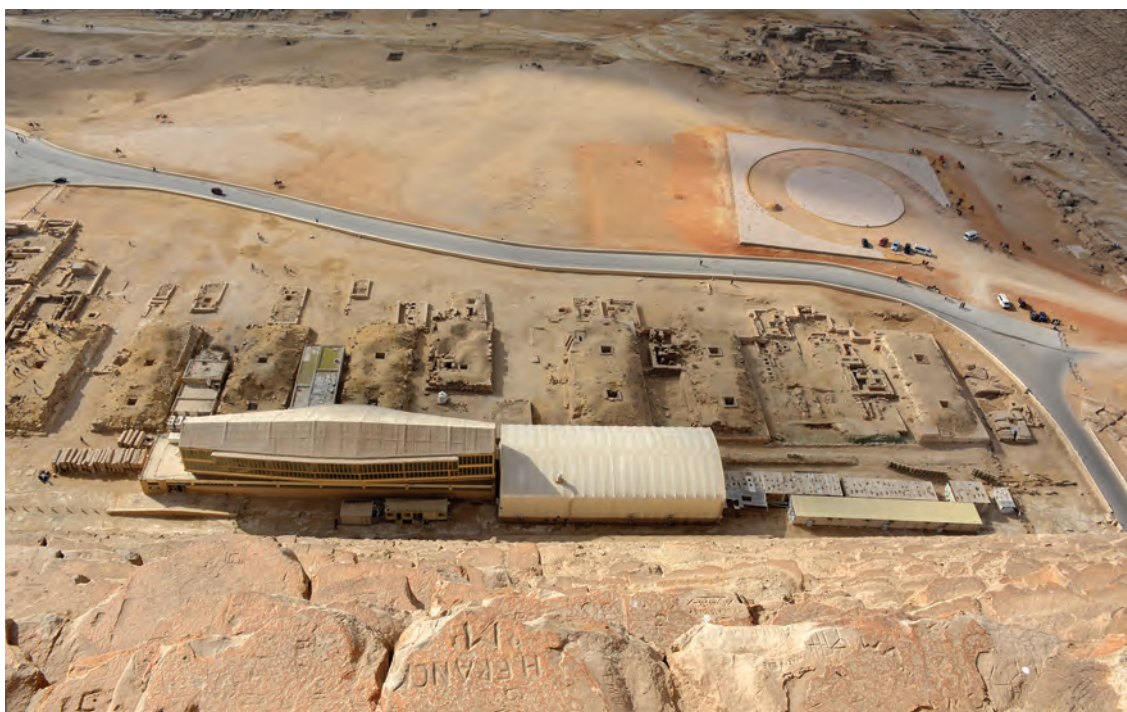
Figure 2. View of the pavement on the south side of the Great Pyramid in 2018 showing the boat museum and, immediately to its right, the tentlike building covering the second boat pit where the Japanese team and MoTA conservators worked on the second boat.

where its pieces were found in 1954. From 2011 to 2021, a Japanese team conserved and extracted the wooden pieces of a second boat, in its pit immediately to the west. After both boats went to the GEM, the MoTA removed the boat museum and Japanese buildings (fig. 2), leaving exposed the southern bedrock surface, which had never been mapped in detail. A further 5,961 m 2 were now available for survey. Using a Trimble SX10 Scanning Total Station, the team produced a digital facsimile of this surface. Figure 3 provides a vector map extraction based on a scan of the Great Pyramid's southeast corner.