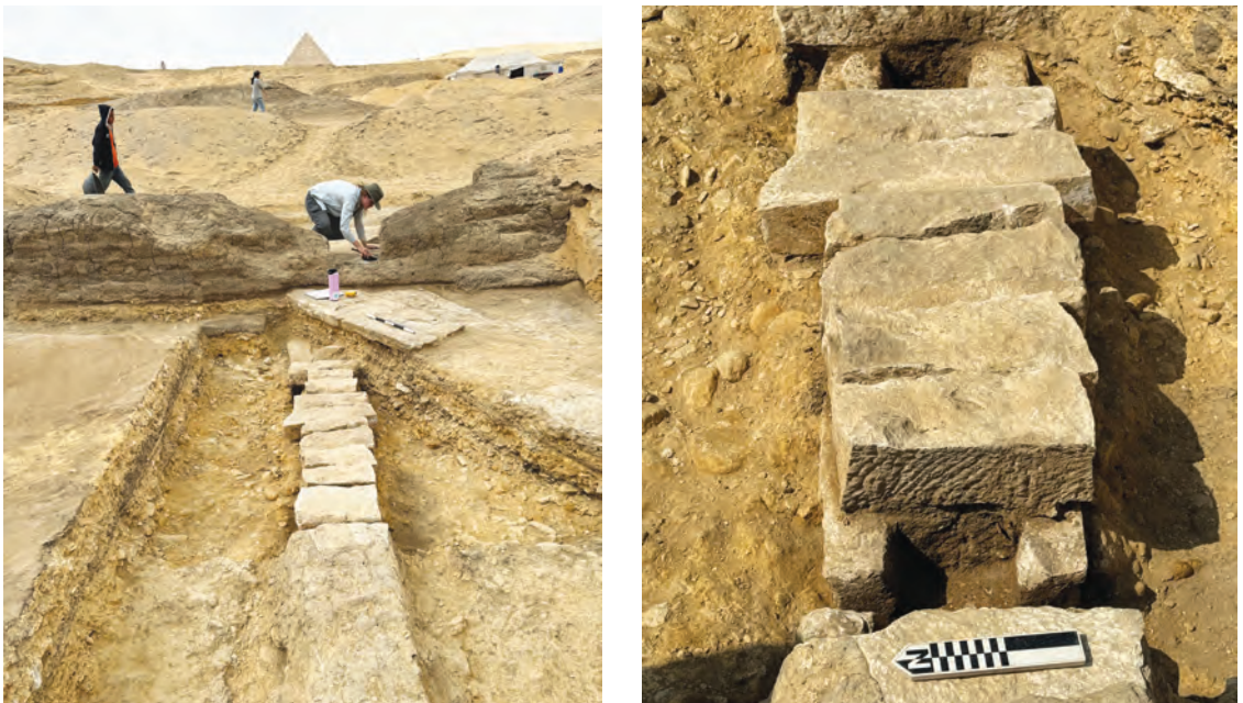
Figure 9. Left: Drain discovered in the 2024 season, running under a limestone pavement and threshold of the Middle Temple, at the east entrance to the main MVT. Remains of mudbrick blocking screen the entrance. Right: The drain to the west, in the main south-central MVT courtyard, shows the same composition. Views to the west.