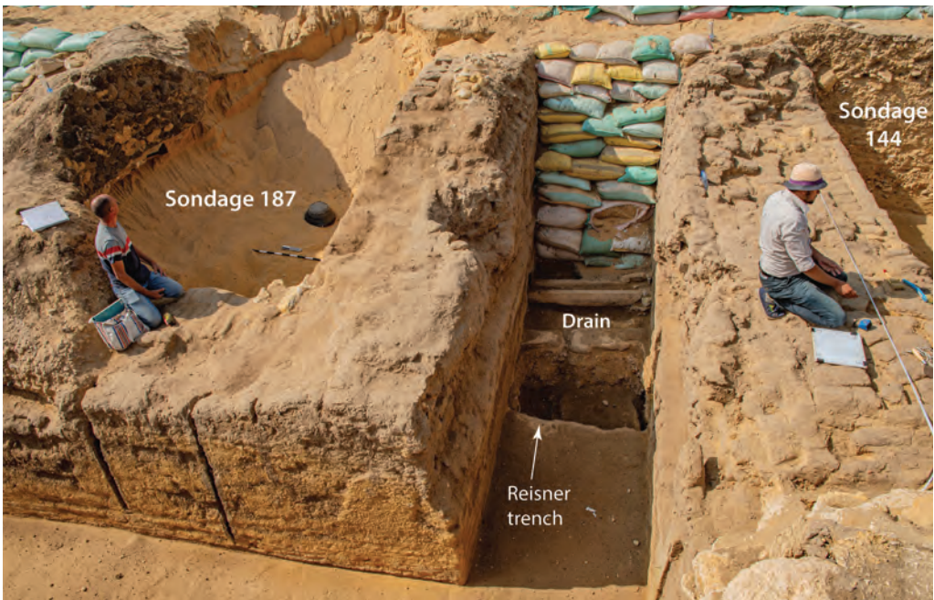
Figure 6. The causeway corridor during the 2021 season, showing the drain formed as a limestone trough and Reisner's trench below the floor. On the left is the sandy fill of Sondage 187. On the right, the top of the north causeway wall is being mapped. View to the west.