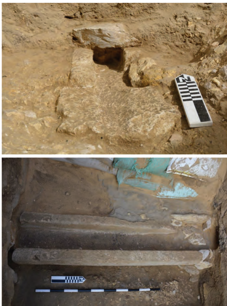
Figure 7. Top: The carved limestone outlet for the drain running from inside the causeway corridor through the south wall and into Sondage 187. Bottom: View of the limestone drain in the west causeway corridor. The drain extends through both the south wall of the corridor (at left, where it exits in Sondage 187) and the north wall (at right) but does not go all the way through.

In Sondage 172, people resurfaced the interior floor and walls many times. At one point, two thin perpendicular walls formed a small chamber (fig. 8). Two other walls blocked the corridor and show that the corridor was no longer functioning as a pathway to the west but had turned into a closeted space for a settlement of houses and silo granaries in the south end of the Ante-Temple, thus leaving open the question whether the south wall of the MVT ran east over the corridor, as Reisner believed. More likely, the east end of the corridor remained unburied but was compartmentalized as back spaces of the Ante-Temple settlement.