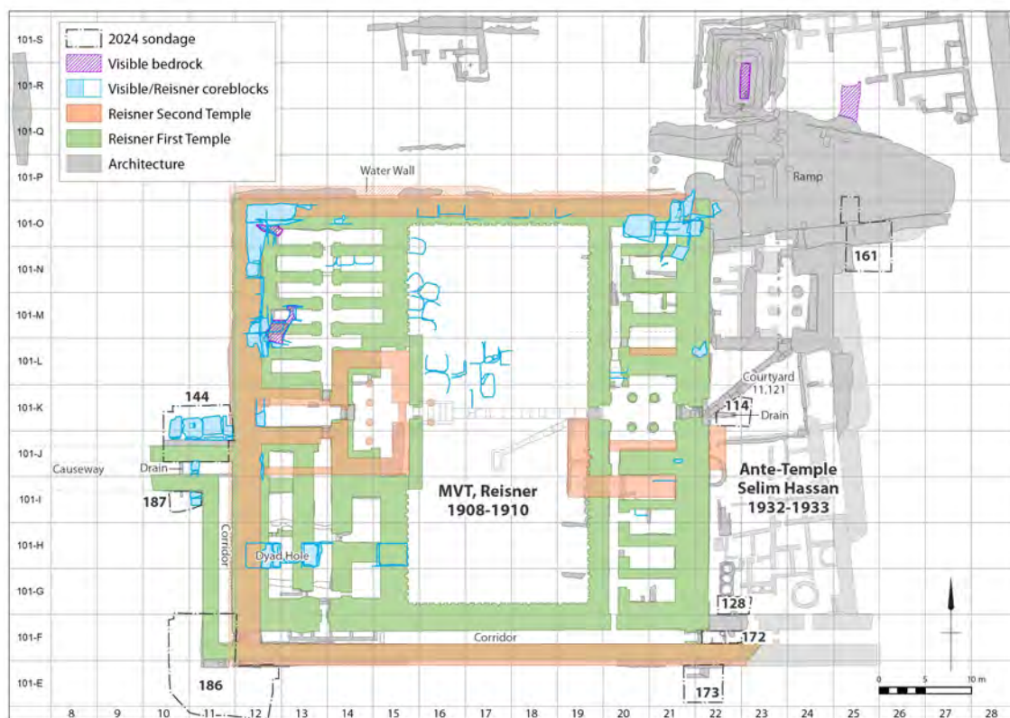
Figure 4. Detailed plan of the Menkaure Valley Temple (MVT) showing our areas of work in spring 2024. Map generated by Rebekah Miracle from AERA GIS.

the floor with the drain outlet, we found dabsch as leveling, then the older MVT1 floor below this debris, and then MVT0 blocks.