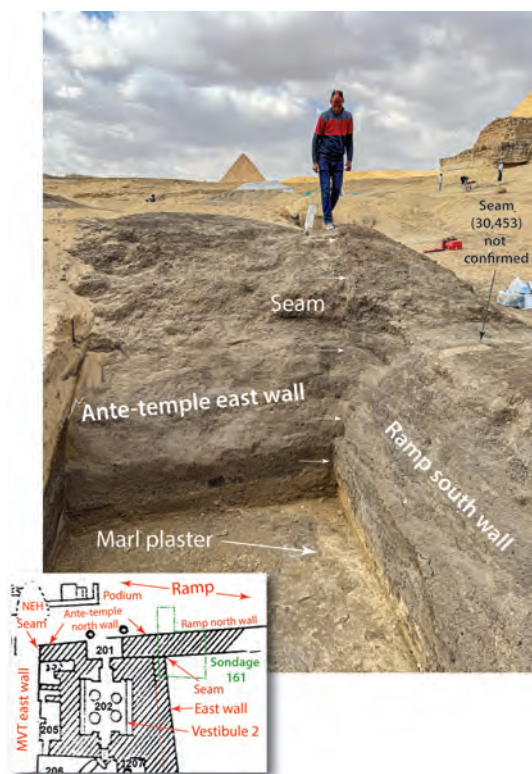
Figure 10. Inspecting a seam (arrows) marked by a thin line of marl plaster. Builders raised the ramp wall and plastered its south face before they built the east wall of the Ante-Temple. View to the west. Inset: Detail from Selim Hassan's map corrected with the newly found join between walls.