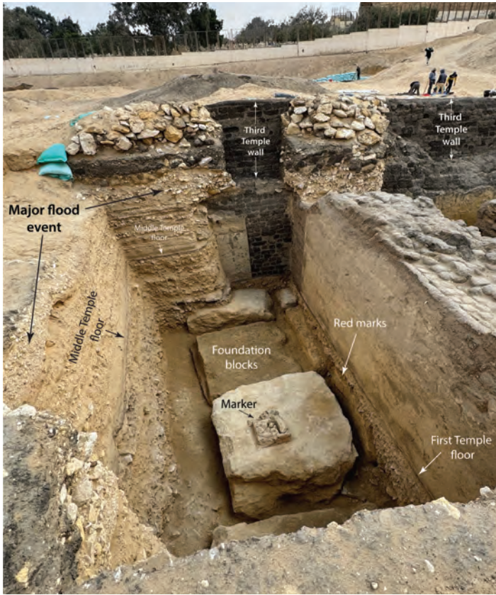
Figure 5. Foundation blocks appear as team members excavate below the First Temple floor in the corner between the north causeway wall and the west MVT wall. View to the east.