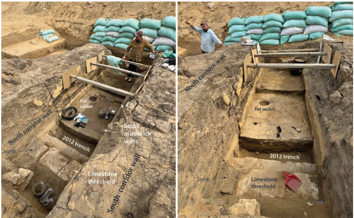
Figure 8. Our excavation in Sondage 172 in the east end of the MVT south causeway corridor. Left: Sondage 172 excavated to the phase of two thin mudbrick walls forming a chamber east of a limestone threshold. A round hole is probably a socket for a ceramic pot. Right: Under the floor with the mudbrick walls we found a clean, well-preserved marl (yellow desert clay) floor, the same kind of marl plaster as that on the corridor walls. This surface was one of a series of floors above the floor contemporary with the limestone threshold. View to the east.