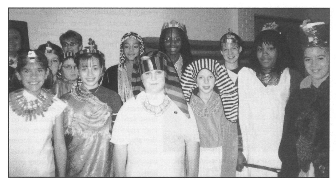
During outreach visit, 6th graders from James Hart Middle School enjoy dressing up as queens and pharaohs for a day.

The Outreach Program continued to retain a loyal cadre of client support, as well as attract new audiences to enjoy this special "in-school field trip" experience. The Outreach Program continued to receive accolades and praise from students, educators, parents, and adults throughout met-