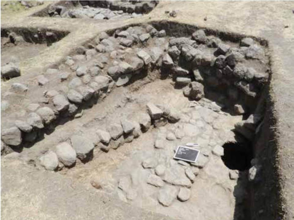
Figure 2. Completed excavations in HB2 photographed from the west, showing bedrock and paved flooring and primary (left) and secondary (upper right) walls