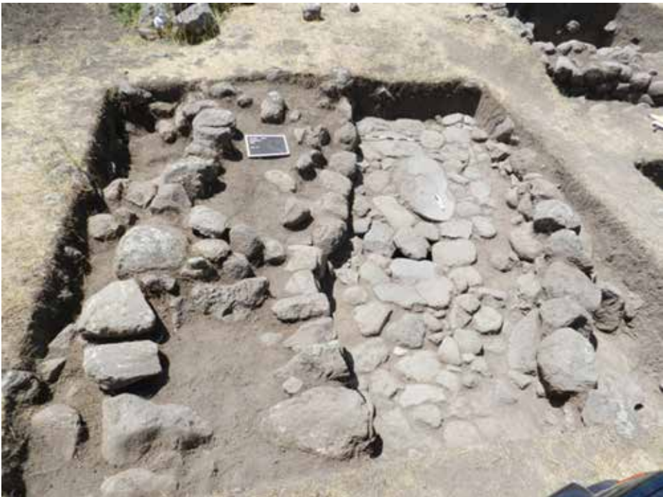
Figure 3. Completed excavation of HB3 photographed from the north. Note the bell-shaped pit opening to the right of center trench, covered with a stone lid