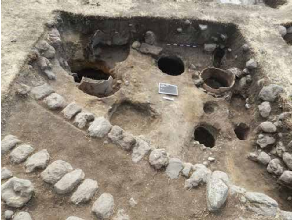
Figure 4. Completed excavations of HB4, photographed from the west