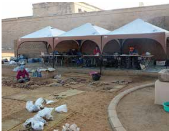
Figure 14. Ceramic analysis and recording in progress under tents on site