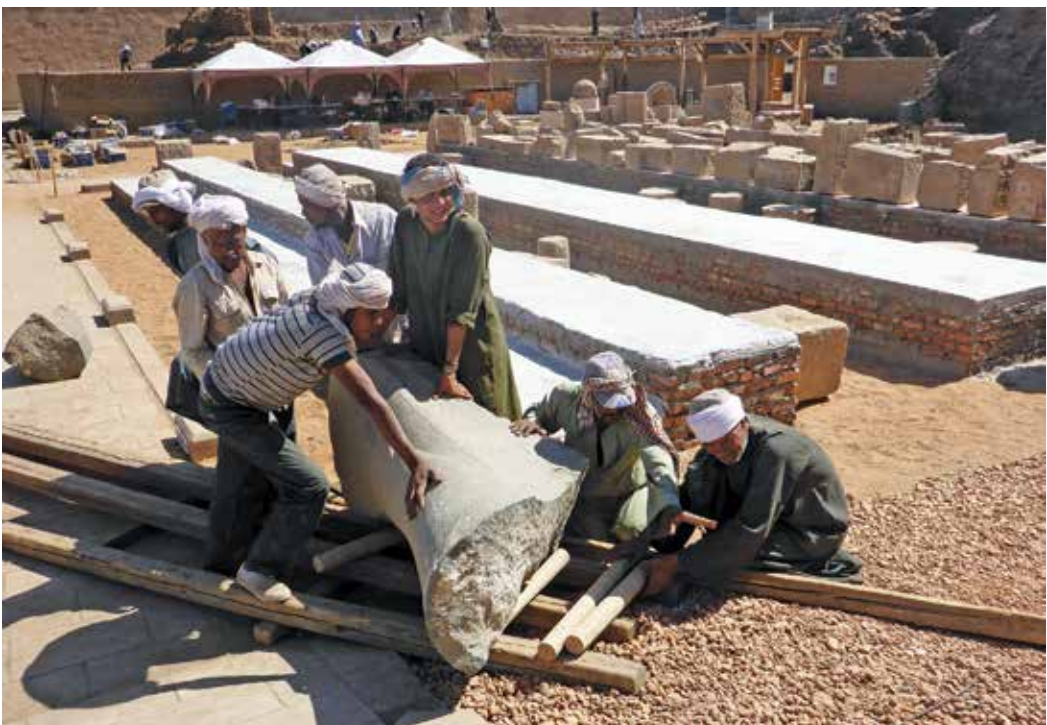
Figure 16. The Egyptian team moving a large granite statue piece