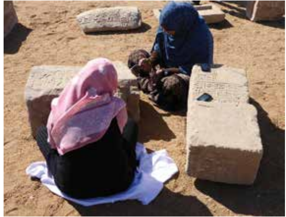
Figure 18. Inspectors working in the blockyard for training

Roman sanctuary (fig. 17). Furthermore, the work at the blockyard involved the training of several inspectors from the local Edfu inspectorate (fig. 18).