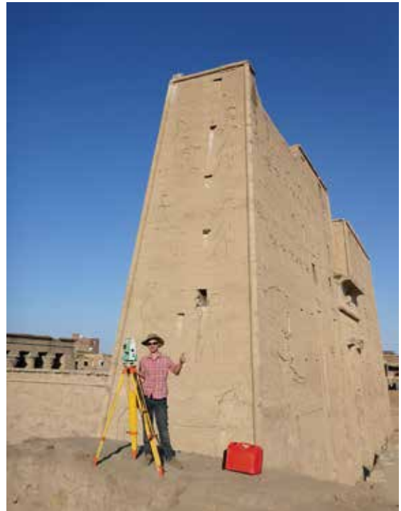
Figure 20. Nadine using the new total station donated to the Tell Edfu project by Andrea Dudek