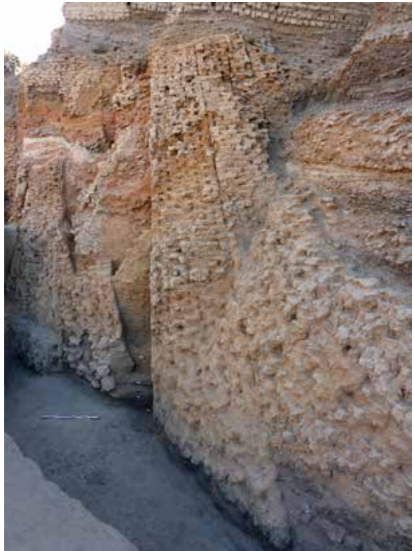
Figure 9. Old Kingdom enclosure walls along western side of Zone 2