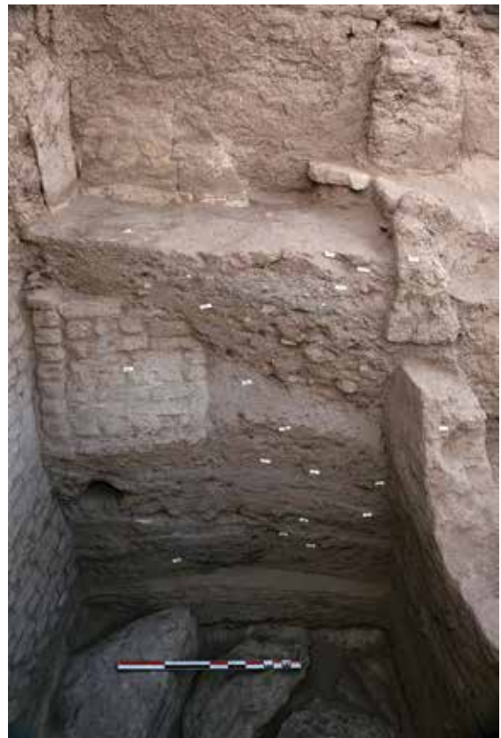
Figure 11. First deep trench in Zone 3 showing foundations of enclosure wall and underlying bedrock formation

The first trench was dug along the interior of the oldest town wall at a place where it curves from a north–south direction toward the east. This test trench revealed the first mudbrick structures that were constructed in this area, some of which lean against the interior face of the enclosure wall, which also helped to clarify the precise time of its construction (fig. 11). The pottery from the lowest occupation levels detected in this test trench dates to the end of the Old Kingdom and indicates that the first town wall here was built at the very end of the Old Kingdom (Sixth Dynasty) or beginning of the First Intermediate Period (ca. 2160 BCE) on