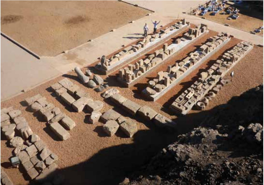
Figure 15. The Edfu blockyard area with the platforms at the end of the season