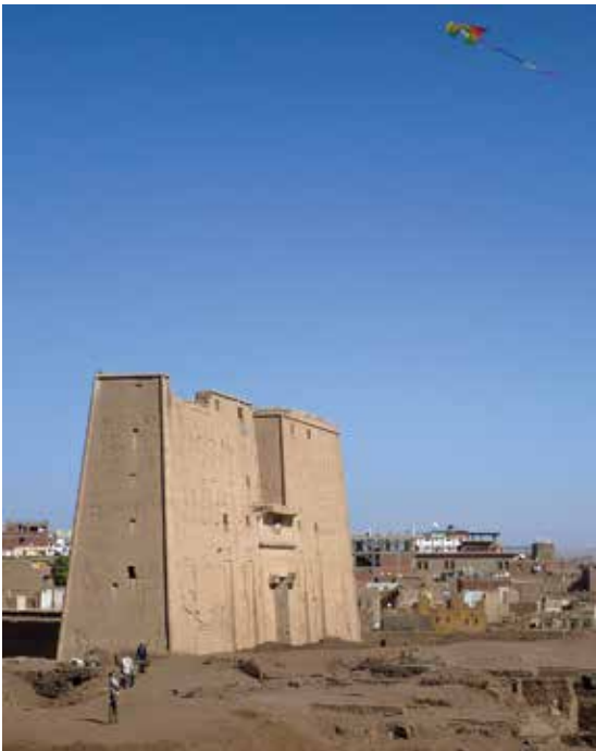
Figure 10. Greg using the kite for aerial photos

very thick walls and the presence of a small vestibule are good evidence for the official nature of this building.