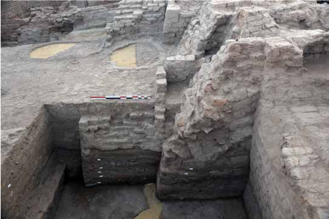
Figure 7. Three phases of Old Kingdom enclosure walls in Zone 2

Excavations also continued at the large building complex, of which the entrance area with a fully preserved wooden lintel and door we discovered in situ during the 2012 season (see News & Notes 220, p. 7, fig. 5). The extremely thick mudbrick walls (more than 2 m wide) of this complex suggest that this was some kind of official or cultic building, certainly not one of a simple domestic character.