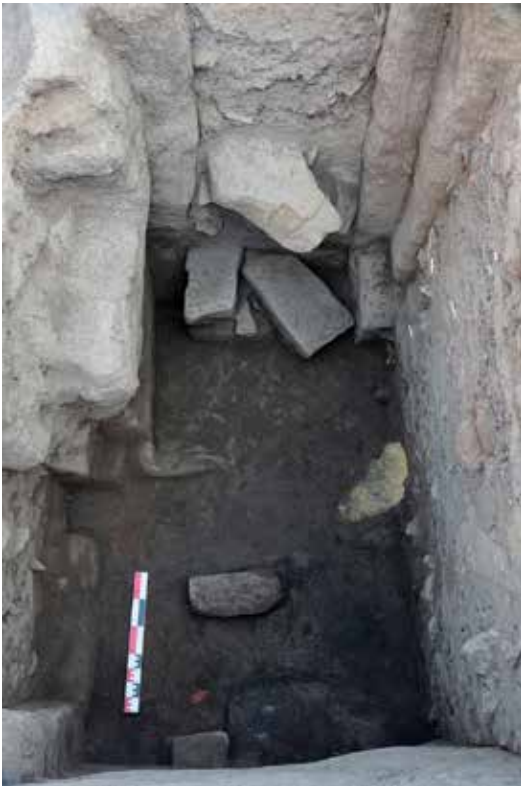
Figure 8. Occupation level and doorways of the entrance room, large building complex