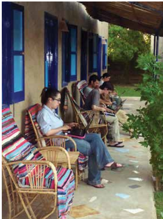
Figure 22. Students working on their computers after returning from the field