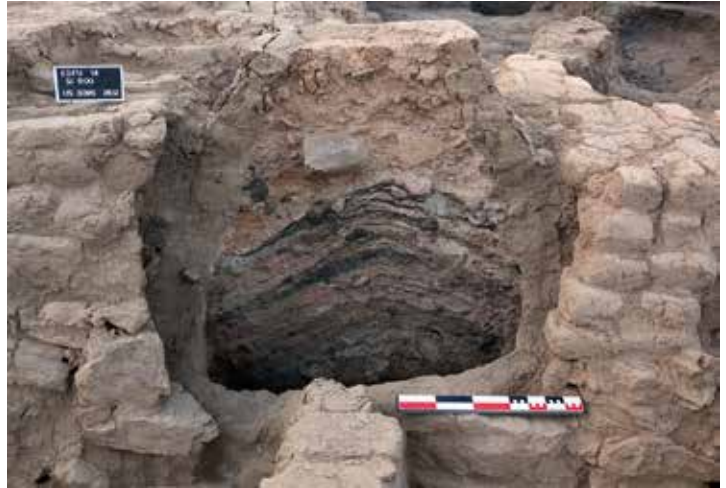
Figure 5. Profile view through one of the silos showing the dense fill of ash deposits

walls were not built on previously unsettled ground as originally expected but are in fact covering older mudbrick walls. Most of those are rather thin, in several cases only one brick thick (ca. 15 cm; fig. 6) and the pottery fragments recovered from the associated floor levels can be dated to the late Fourth Dynasty according to a preliminary analysis. Among the discovered objects were several limestone fragments that were once part of seated and standing male figures.