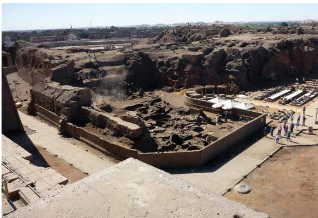
Figure 3. View of Zone 2 and the tell in the background taken from the roof of the Ptolemaic temple