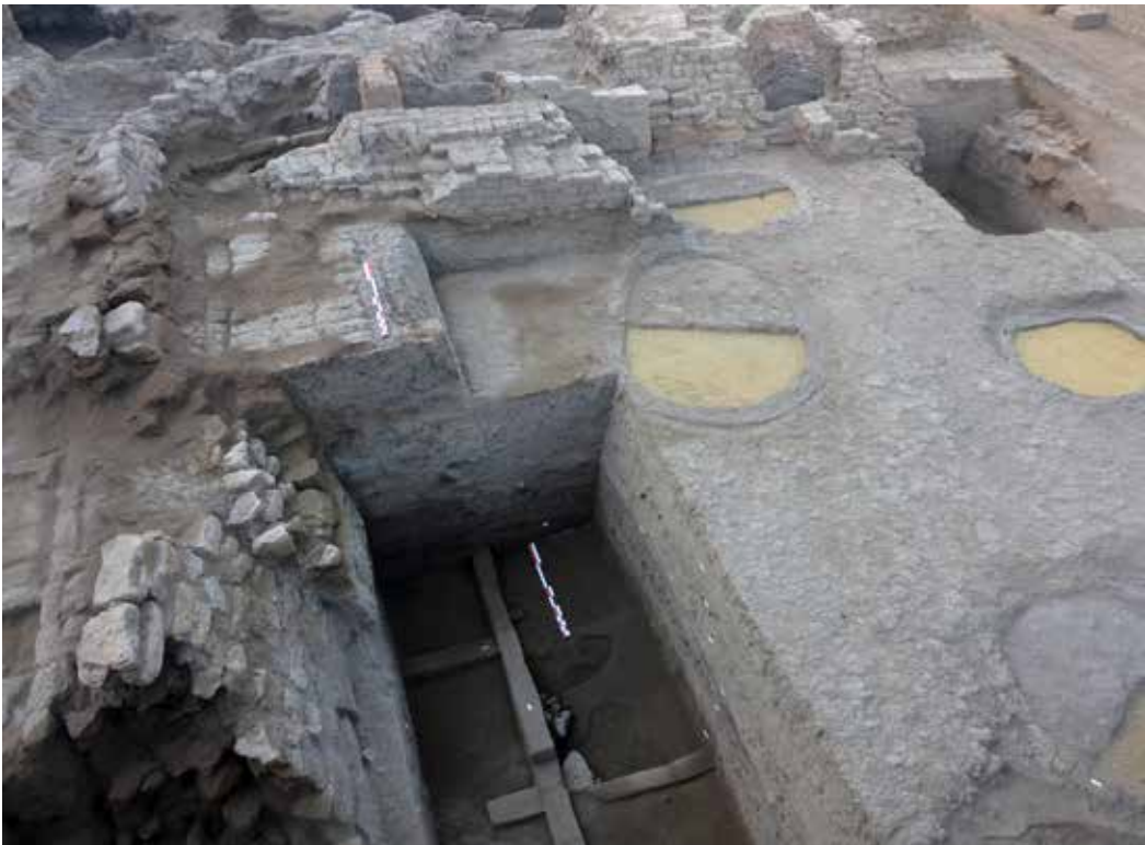
Figure 4. Old Kingdom enclosure walls and silos in Zone 2

This preparation of the ground involved the dismantlement of older wall systems, and the leveling operations can be witnessed by a thick layer of mudbrick demolition fill covering much of the surface in this area. The small silos contained different kinds of settlement debris, in some cases a lot of ash and mixed pottery fragments (fig. 5). No traces of the original material stored in them has been found and it is evident that they were filled in by old settlement trash when they fell out of use at the end of the Old Kingdom. According to a preliminary analysis of the ceramics found in these fill layers, it is relatively homogeneous and suggests the relatively rapid dumping of material to fill up the by then unused silos. The irregular shapes of these silos is quite noticeable, ranging from the better-known round examples with a small circular opening on top that would have corresponded to the height of the ground level from which these storage installations could be filled and emptied, to more unusual oval shapes. The latter are probably the result of the underlying wall systems these silos were built into, and which restricted the available space underground.