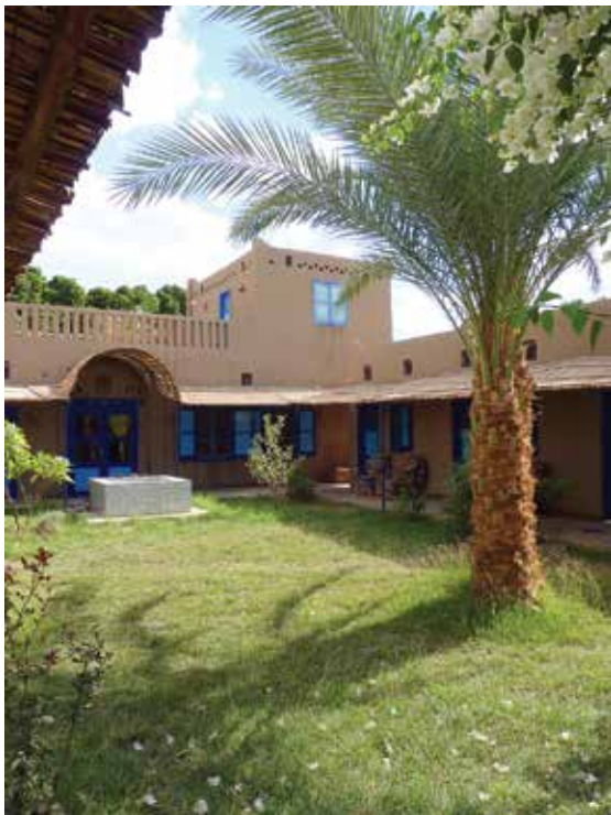
Figure 21. The inner courtyard of our new accommodations