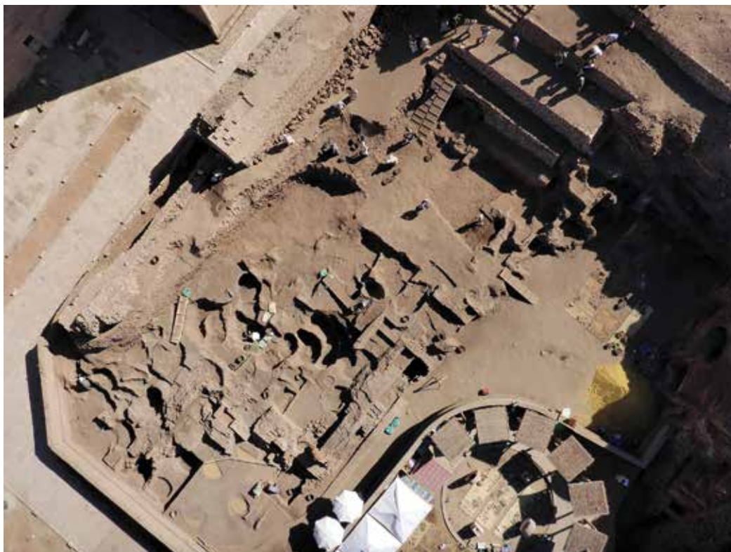
Figure 2. Aerial view of ongoing excavations in Zone 2