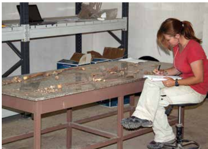
Figure 19. Rose analyzing one of the human skeletons in the Elkab magazine

Kathryn Bandy was able to take the final photographs and check some additional details of the hieratic ostraca that were excavated in previous seasons in the silo area (Zone 1) for her dissertation research. Clara Jeuthe completed the recording and study of the lithic material excavated in Zones 1 and 3. She also prepared a number of samples that were sent to the French Institute in Cairo for further analysis and to be added to a larger database on the flint sources of Egypt.