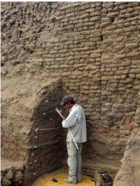
Figure 12. Oren drawing a profile in the second trench of Zone 3

The three test trenches in Zone 3 have not only provided a complete ceramic sequence from well-stratified archaeological layers dating back to the foundations of the various town walls, they have also revealed the characteristics of geological formations pre-dating human activity. These factors reinforce Tell Edfu's significance as a site that is important for the study of site formation processes and environmental change. In terms of settlement development, it is now clear that the first enclosure wall to the north of the Old Kingdom town center was founded in a previously unsettled area and therefore it can be considered a major enlargement in this direction. It is also evident that this new wall enclosed a part of the town that had developed previously extra muros .