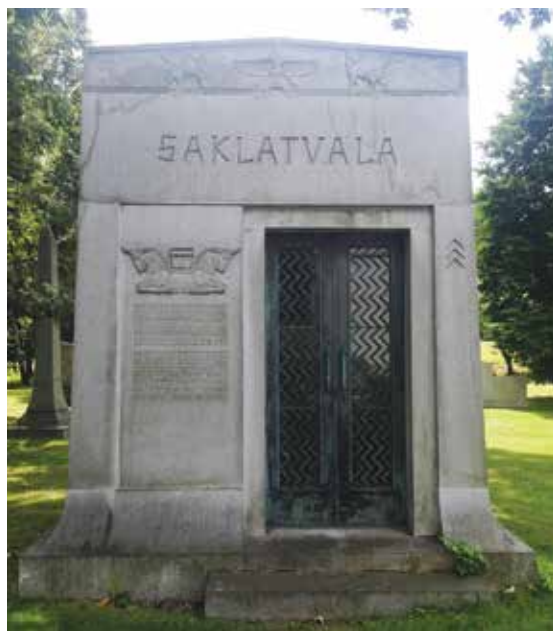
The Saklatvala tomb at Woodlawn Cemetery, New York City

A review of the French and English versions of a volume on the palace of Darius at Susa edited by the late Jean Perrot ( Le palais de Darius à Suse , Paris 2010; The Palace of Darius at Susa , London 2013), in Bibliotheca Orientalis 72 (2015): 518–32, is tinged, as the