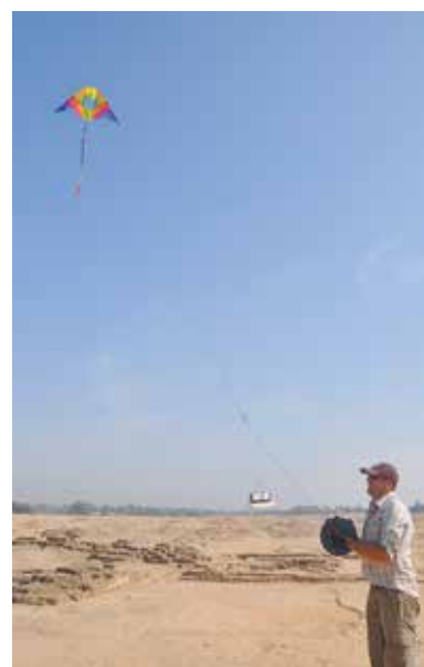
Greg preparing a photogrammetry with a kite at Dendara

His goal in this new collaborative research program is to focus on the study of the enclosure walls and the settlement area in the internal and external parts of the Hathor sanctuary precinct, the sister site of Edfu, located 40 miles north of Luxor. During three weeks, he excavated several stratigraphic trenches; some situated less than 60 feet away from the main temple (rebuilt during the Roman period). Most