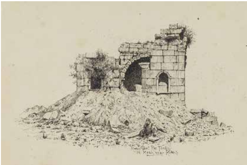
"Ruins of Dat Ras Temple in Moab, near Keirak" [Kerak, Transjordan], undated (probably 1920s or 1930s). Pen and ink on paper. 12.8 x 14.0 cm