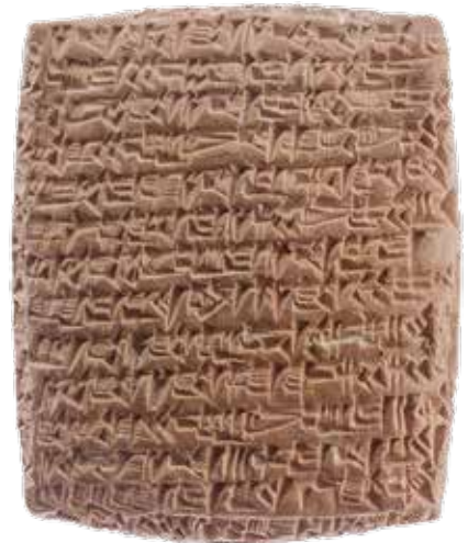
Figure 4. An Old Assyrian cuneiform business letter from Kültepe, Turkey, ca. 1950–1836 BC. As featured in the mini-exhibit Doing Business in the Ancient World. OIM A22181