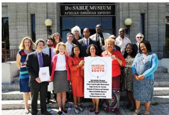
Figure 12. Press conference for the inauguration of the Museum Campus South consortium at the DuSable Museum of African American History