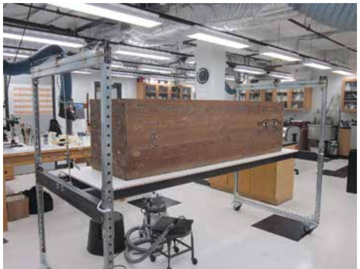
Figure 17. The coffin of Ipi-ha-ishutef (OIM E12072B) on its custom-built platform in the Conservation Lab

We will remember this past year as the Year of the Coffin — the coffin of Ipi-ha-ishutef, to be exact (OIM E12072A–B). From the construction of the coffin itself to the meticulous detail of the painted hieroglyphs, the coffin is one of the highlights of the Museum's collection. Due to the generosity of the American Research Center in Egypt (ARCE), the Oriental Institute received funding to support the conservation and research of this wonderful example of a First Intermediate Period wood coffin. It has resided in the Conservation Laboratory for most of the past year where it rests on a custom designed and built platform, compliments of Preparator Erik Lindahl, and where it is literally the center of attention (fig. 17). Assistant Conservator Simona Cristanetti is the lead conservator for the project. Her position is supported by the ARCE grant and has allowed her to focus on the coffin and its complex treatment over the past year (fig. 18). Associate Conservator Alison Whyte, who undertook the conservation of the lid with its highly decorated surface and own particular set of challenges, joined Simona on the project (fig. 19). Updates on Simona's and Alison's work can be found on the Oriental