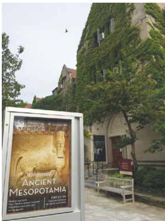
Figure 1. One of the newly installed kiosks outside the Oriental Institute featuring a poster designed by Joshua Tulisiak

An important new project initiated in 2014–15 was the Gallery Enhancements Project. This project will enable the museum to fulfil an important objective — to improve the quality of display of its collections to the public in time for the Oriental Institute centenary in 2019, made possible through the generosity of an anonymous donor, although with a portion of funds yet to be raised. There are three main objectives to this project: 1) the design and installation of new free-standing display cases throughout all the galleries that will complement the