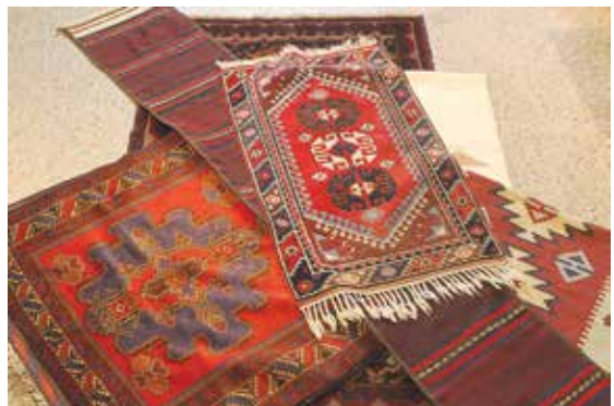
Figure 23. A selection of merchandise available at the Suq