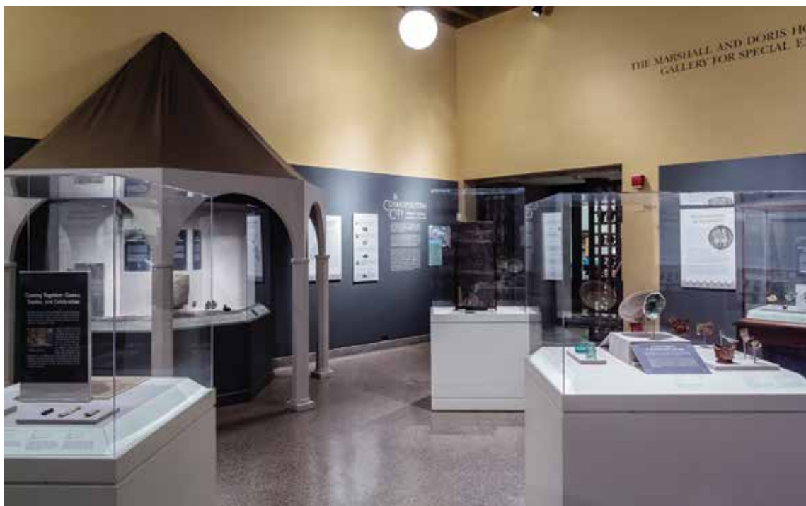
Figure 7. View of the Cosmopolitan City exhibit, looking toward to entrance. The door from the ark of the Ben Ezra synagogue is in the center, the pavilion with documents of the three religious communities of Fustat to the left