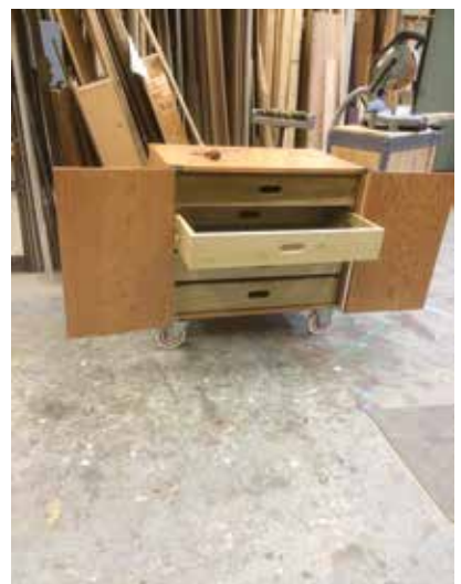
Figure 22. Museum activity cart near completion