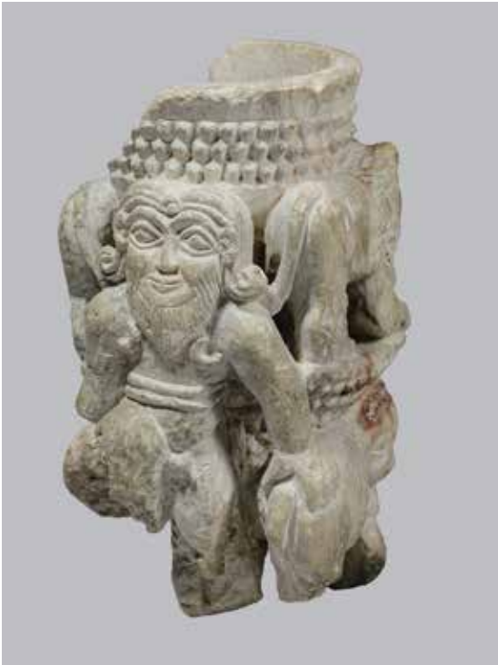
Figure 6. The “Agrab Cup,” a stone cup with nude hero, bulls, and lions. Tell Agrab, Shara Temple, ca. 3000–2650 BC. Iraq Expedition of the Oriental Institute, 1930–1937. OIM A17948