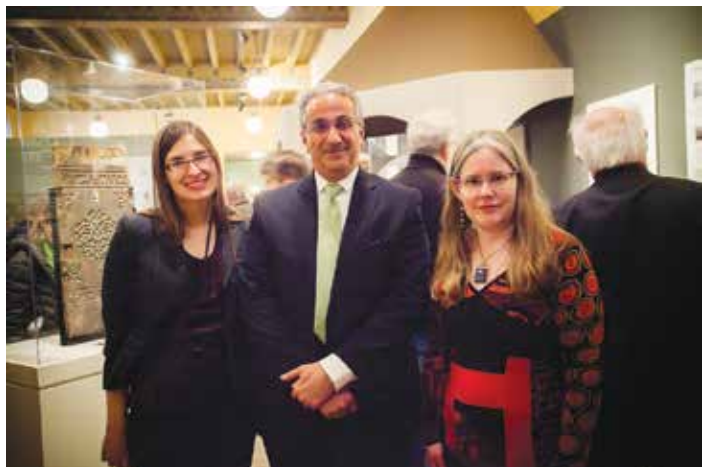
Figure 10. Consul General of Egypt Maged Refaat with exhibit co-curators Tanya Treptow and Tasha Vorderstrasse at the members’ reception