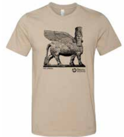
Figure 24. A selection of merchandise available at the Suq