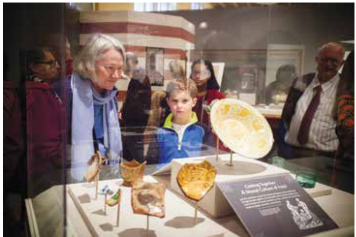
Figure 9. Guests at the member’s preview of Cosmopolitan City exhibit admire ceramics.

In addition to the program for the Holleb Gallery, we mounted an abbreviated version of the Our Work: Modern Jobs — Ancient Origins photos by Jason Reblando on the lower level of the Institute (September 2, 2014–ongoing).