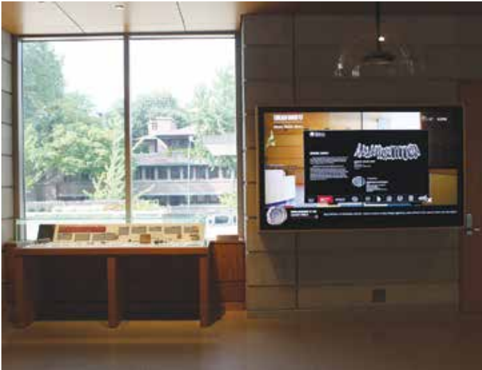
Figure 3. The Oriental Institute mini-exhibit Doing Business in the Ancient World and adjacent touchscreen in the lobby of the Booth School of Business