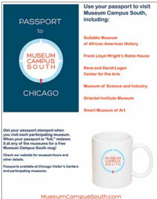
Figure 13. Promotional materials for the Museum Campus South Passport program. Designed by Josh Tulisiak

Park-Washington Park cultural institutions. With support from Choose Chicago, our roll-out consisted of a shuttle in August 2014 that connected all the museums. We printed and distributed rack cards and had a very successful press conference at the DuSable announcing the formation of MCS and we garnered several mentions in the press (fig. 12)