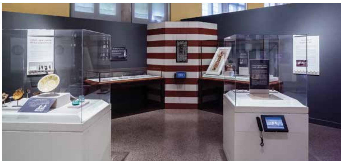
Figure 8. View of the Cosmopolitan City exhibit. Left to right: cases on dining, daily life, dress, and adornment