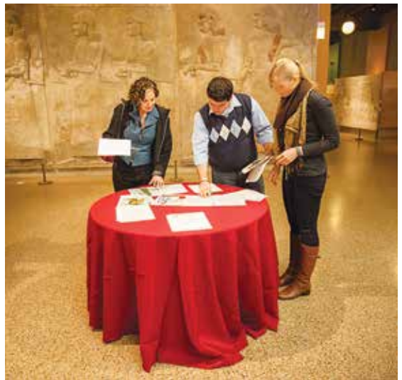
Young Professional Leaders picking up clues at the October Scavenger Hunt, Beer & Wine through Ancient History

On Thursday, October 16, 2014, the Young Professional Leaders sold out its second annual fundraiser; this year's theme was Beer & Wine through Ancient History: A Scavenger Hunt. We would like to thank all the sponsors, members, and patrons who attended and helped us raise over $6,000 to