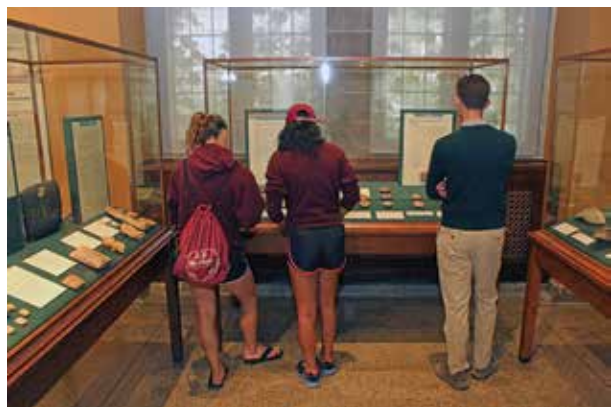
UChicago students enjoy cinnamon buns in the lobby and ancient artifacts in the galleries at Bulls and Buns