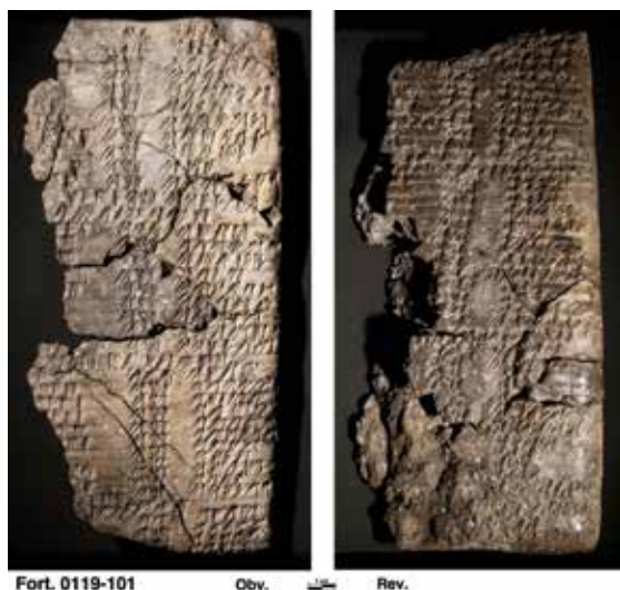
Figure 2. A tablet nerd's garden of delight: a close parallel to a hitherto unique text. This damaged list of thousands of fruit seedlings or saplings — including apples, pears, dates, figs, olives, quince, mulberries, prune-plums, pomegranates(?), and others — and their nurserymen at several plantations ("paradises") corroborates Classical historians' descriptions of the lush paradises in the Persian heartland that Alexander the Great encountered

I recorded first-draft editions of Elamite texts on about 30 more Fortification tablets and fragments, for a running total of about