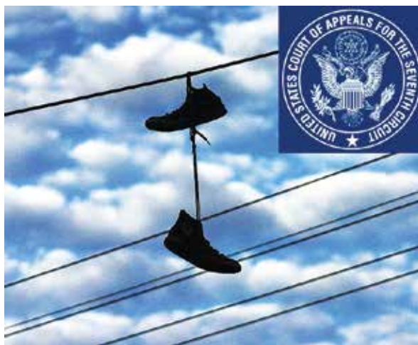
Figure 1. The Other Shoe: in a split decision, the Court of Appeals affirmed the summary judgment against the plaintiffs in the lawsuit over possession of the PFA

As the wheels of justice continue to turn, the Persepolis Fortification Archive Project continues to collect, correct, and display images, texts, seals, and catalog information. Dude-like, the editorial staff abides, sometimes daunted by the scope of the work to be done, sometimes delighted by fresh discoveries. As veteran student workers move on in their academic lives new students come into the Project, thanks to timely support from the Roshan Cultural Heritage Institute, and some student workers begin to build their own research with the products of the PFA Project.