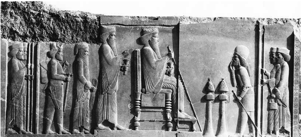
Figure 8. The royal audience in monumental form: relief moved in antiquity from the Apadana staircase to the Treasury of Persepolis, where it was discovered by OI excavators in 1935–37

Since 2006, the PFA Project has increased the number of known Elamite Fortification documents (the largest Elamite language corpus anywhere) by more than 40 percent; increased the number of known Aramaic Fortification documents (the largest unpublished Imperial Aramaic epigraphic corpus) by about 80 percent; increased the number of known epigraphs on Elamite tablets (the largest corpus of such epigraphs anywhere) by about 300 percent; increased the number of identified Fortification seals (the largest corpus of Achaemenid art anywhere) by about 125 percent; increased the number of publicly accessible Persepolis Fortification tablets and fragments — via images, preliminary and advanced text editions, seal drawings, and/or cataloging information — by about 350 percent; and published many of the implications of this corpus for Achaemenid languages, art, religion, society, institutions, geography, and history (sometimes with effects beyond the ordinary limits of ancient philology, art, and history).