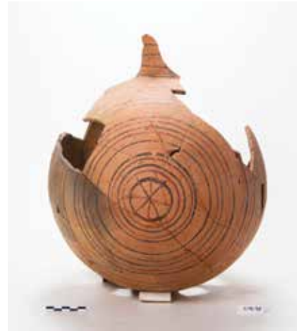
Figure 5. A bichrome painted barrel jug from the Middle Bronze Age building in Area 2

The excavations in Area 2 this season revealed a Middle Bronze Age occupation of Zincirli that was previously unknown. Furthermore, the preservation of the contents of these rooms due to their violent destruction promises to reveal much new information about the Middle Bronze Age of this region in future seasons.