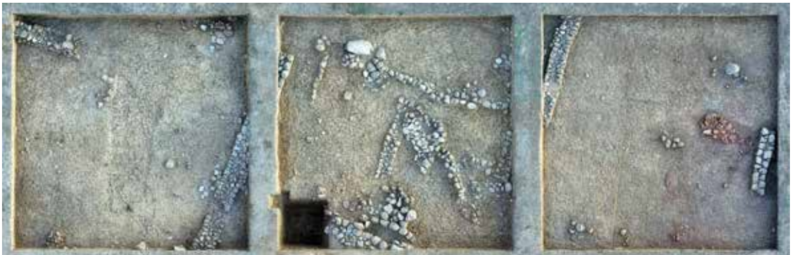
Figure 8. Area 8 in the Southwest Lower Town, showing the latest two architectural phases dating to the Iron Age III and the probe in the central square that revealed an Early Bronze Age destruction layer below the Iron Age occupation

ring attached to a pinkish stone scaraboid seal, inscribed in Aramaic script with the name of the owner, was found in this courtyard. To the west (square 65.41), two semi-enclosed spaces each contained a bench with a lower grinding stone, and a variety of small hammerstones and pestles was found in the vicinity (fig. 9). A stamp seal was found in this area. To the east (square 65.43), a small building or portico was bordered by two walls with a post base in between. A sherd of an imported Ionian cup dates this phase to the late seventh century BC.