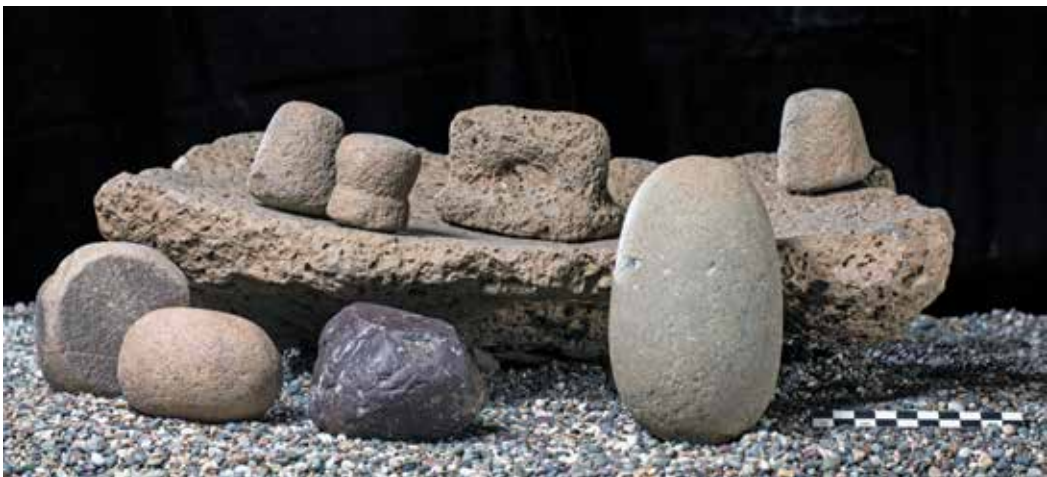
Figure 9. A selection of grinding and pounding stones found near two grinding installations in the latest Iron Age III occupational phase of Area 8

The earlier phase of architecture encountered this season was not fully excavated, but two elongated rooms on the same orientation as the later courtyard were beginning to emerge. To the west (square 65.41) was an open, external area that seems to have been used for trash disposal and produced a lot of pottery and bone. To the east (square 65.43) was an earth floor with several storage jars and smaller vessels embedded in it. On this surface were scattered more than a dozen clay loom weights. These probably fell from a higher level onto the floor.