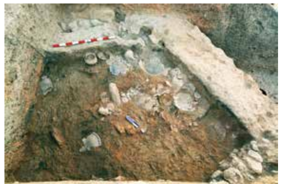
Figure 3. The upper room of the destroyed Middle Bronze Age building in Area 2. A number of smaller vessels fell on, in, and around a group of four storage jars in one corner

The burnt Middle Bronze Age building must have been eroding out of the slope of the mound for the centuries during the Late Bronze Age and Early Iron Age when the mound was unoccupied. In the Iron Age II, a stepped stone retaining wall was cut into the burnt debris in order to stop the erosion (fig. 2). At the base of the retaining wall, a 2-m wide level foundation of cobblestones was laid, perhaps as a base for a fortification wall. Parts of both of these stone walls were cut by the nineteenth-century German trench. This makes it difficult to know whether the two stone walls were contemporary, or if one was built after the other.