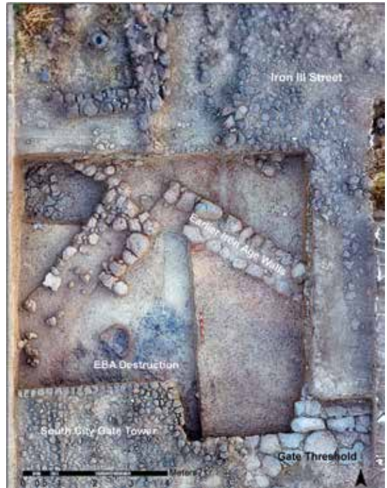
Figure 7. Area 4 by the South City Gate. A sounding below the Iron Age II and III South Gate and associated street revealed wall foundations of an earlier Iron Age phase, set into a destruction layer of the Early Bronze Age

The above-mentioned walls were set into a layer of burnt mudbrick debris. Below this debris were the smashed remains of several ceramic vessels of Early Bronze Age date lying on or set into a pebble floor (fig. 7). No associated architecture was found, but elsewhere in the trench a partially cobble-paved floor clearly ran below the walls that predated the Gate. While Early Bronze Age material was known already from the high central mound of Zincirli, this is the first evidence of a lower town occupation of this period. Two radiocarbon dates from the burnt debris confirm a date for this destruction in the mid-third millennium BC (personal communication, Sturt Manning).