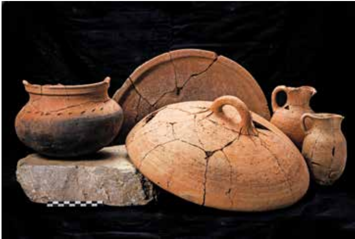
Figure 4. Cooking vessels from the Middle Bronze Age building in Area 2