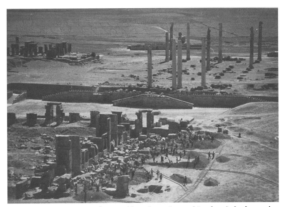
Throne hall, portico, and north part, with Darius' Palace and Apadana in background. Persepolis

word. All they had to do was download from the Adobe website the free "plug-in" for their web browser software of choice and install it on their computer system.