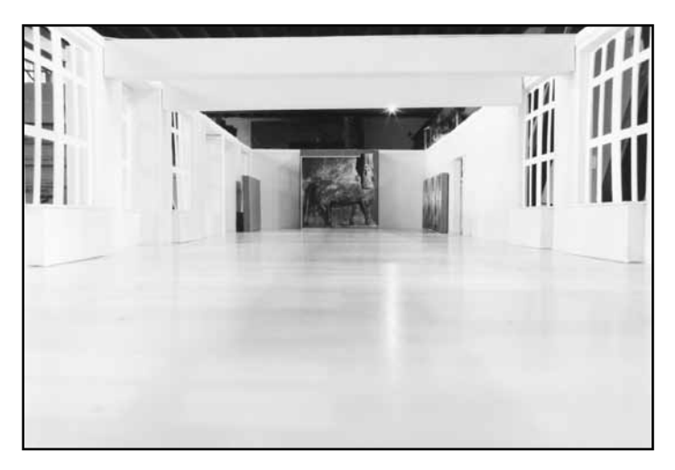
View inside scale-model of north gallery, site of future visitor center, Khorsabad Court, Mesopotamian, and Prehistoric galleries

Before the reinstallation began, and after a lengthy selection process, the Oriental Institute had awarded the project of designing the galleries to the acclaimed architectural firm of Vinci/