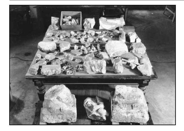
Pair of statues from Khorsabad as they were originally brought back from the site (above). Statues being prepared for installation in 1935, after restoration (right)

The fundamental importance of the Oriental Institute's collection is that it is much more than just an assortment of very old and pretty things. What distinguishes us from many other institutions exhibiting archaeological artifacts is the fact that the preponderance of our collection comes from what is referred to as "stratified contexts," meaning the artifacts were unearthed in systematic excavation; they can be more accurately identified and perhaps better understood than artifacts with no known provenance (findspot) or those purchased on the open market. This characteristic cannot be overemphasized. Only a very small number of museums in the world can claim this distinction. Moreover, many of the archaeological sites represented in our museum have provided some of the most substantive information available about the history of humankind and the emergence of the earliest societies on earth.