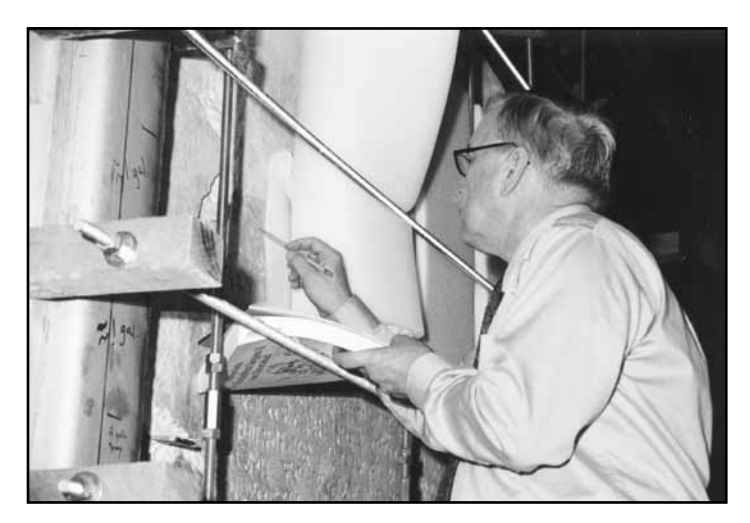
Professor John A. Brinkman transliterating cuneiform inscription on back of Assyrian relief still encased in its temporary protective framing

Many of the most important aspects of the design of the museum's exhibitions are not immediately visible to the uninformed visitor, but most are directly related to the need to display the objects in a stable environment that will best preserve them. Even something as simple as too much daylight or a live plant can have severely detrimental affects on ancient and delicate artifacts. Light increases the deterioration process and accelerates damage to objects, which is cumulative. It is for this reason that the museum installed windows with a type of film between the panes intended to lower the visible light level in the galleries and sought out special window shades that further filter ultraviolet light. The climate control system - installed to maintain ideal temperature, humidity, and air filtration in all of the areas holding collections in the Institute — is yet another important element in the gallery design, and a critical one considering our collections, which include large numbers of especially fragile objects such as wood, bone, papyrus, and textiles. The effectiveness of this system can be undermined by the simple gesture of introducing fresh flowers or live plants into the galleries. Infestation of pests brought in on those plants and flowers has to be considered a threat, as they might permeate the vents and affect the entire air system, jeopardizing the objects.