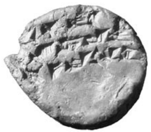
Figure 13.7. Concluding portion of a date, inscribed on a bulla from Bastam. The beginning of the description of events that took place in this year is on the edges of the bulla. Scale 2:1