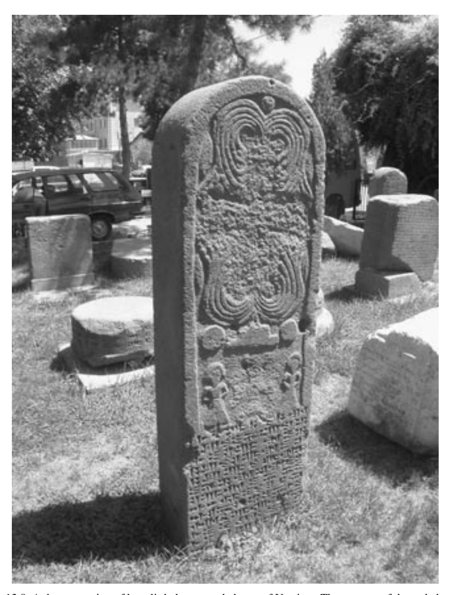
Figure 13.8. A demonstration of how little later people knew of Uraritan. The top part of the stela has been re-carved to make a tombstone, but the Urartian curse formula for anyone who damages the stone has been left in place at the bottom. Van Museum