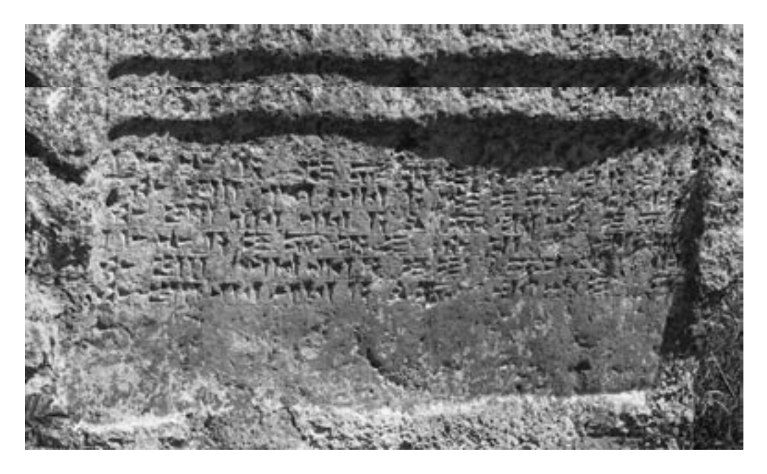
Figure 13.4. Dedicatory inscription of Minua in a garden south of Van, containing the only feminine name (Tariria, daughter of Minua) in the Urartian corpus