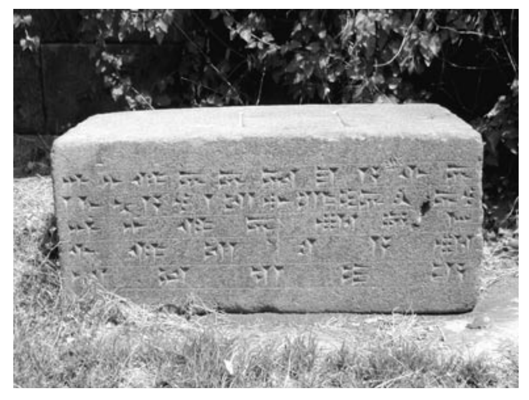
Figure 13.3. Typical building inscription, now in the Van Museum. Minua records the construction of the "gates of Haldi"