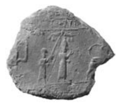
Figure 13.5. Sealing of Rusa II on a bulla from Bastam with cuneiform legend above and below figures. Scale ca. 4:3