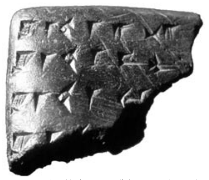
Figure 13.6. Seventh-century clay tablet from Bastam listing sheep and personal names. Scale 2:1