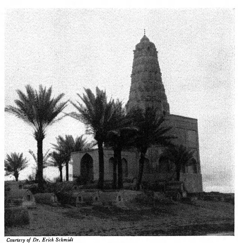
TOMB OF ZUBAIDAH