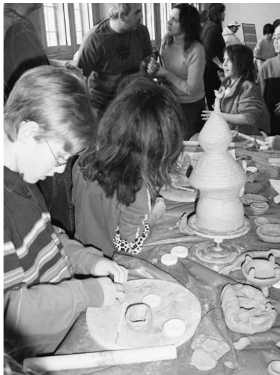
Figure 2. Ancient-style pottery making fascinated visitors of all ages during the opening of Empires in the Fertile Crescent.