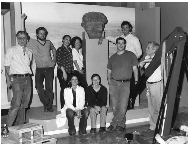
Figure 1. East Wing galleries installation crew.

The exhibition was generously supported by private donors who made possible the Dr. Norman Sohlkhah Family Assyrian Empires Gallery, the