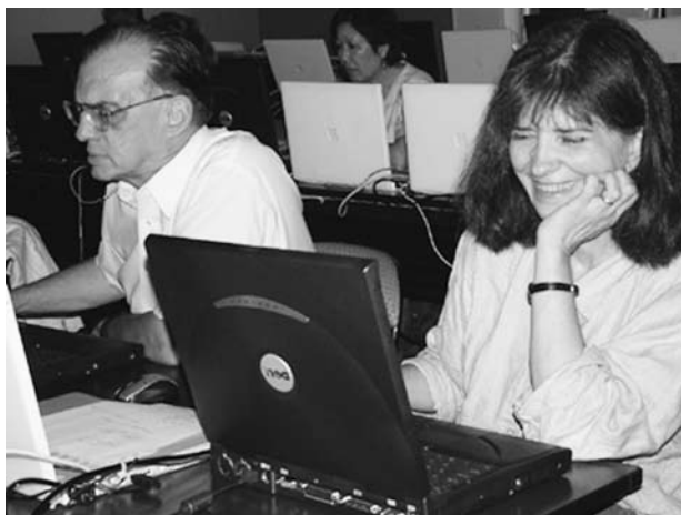
Figure 17. K-12 teachers hone their computer skills during a training workshop preparing them for the distance learning sessions we presented on-line during Ancient Mesopotamia: Meeting Chicago Public School Mandates, a professional development project supported by the Lloyd A. Fry Foundation.