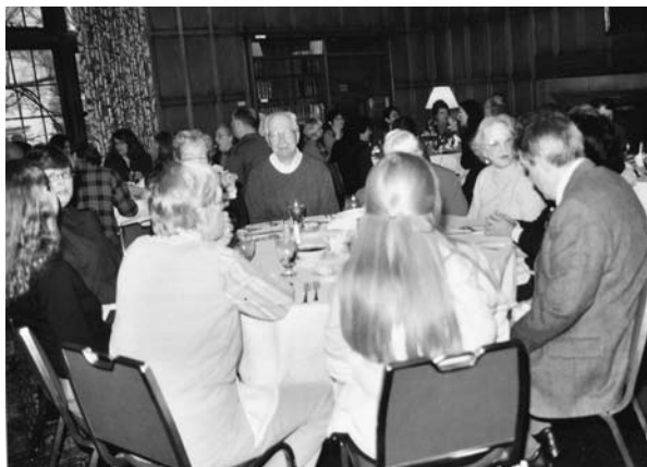
Figure 11. The December Volunteer Recognition Ceremony always ends with a festive luncheon at the Quadrangle Club where docents, faculty, staff, and volunteers all enjoy a meal together