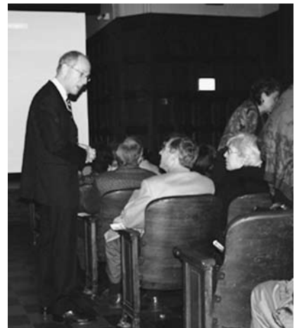
Figure 5. Theo van den Hout, Professor of Hittite and Anatolian Languages and Executive Editor of the Chicago Hittite Dictionary, chats with the crowd that filled Breasted Hall to view the Chicago premiere of The Hittites , a major new documentary.