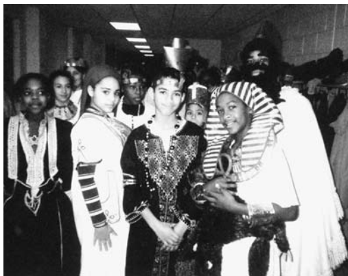
Figure 2. An annual tradition continues at James Hart Millennium School in Homewood, Illinois, where students enjoy an Oriental Institute Outreach visit and dress up like ancient kings and queens