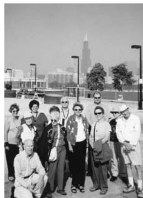
Figure 10. Oriental Institute docents and volunteers pose in front of the magnificent Chicago skyline during their September field trip to see the Stars of the Pharaohs exhibit at the Adler Planetarium