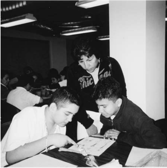
Figure 16. Sixth grade students and fascinated chaperone study animal bones during the Oriental Institute's zooarchaeology workshop. This program was supported by the Chicago Public Schools Department of Mathematics and Science.

model for Oriental Institute on-campus seminars that the Fry Foundation has supported for the past several years. This model includes: lectures on academic content by Oriental Institute scholars; workshops on teaching methods using the Oriental Institute's award-winning classroom curriculum materials; gallery sessions relating classroom curriculum to museum collections; and teacher-creation of classroom and museum lesson plans for their students.