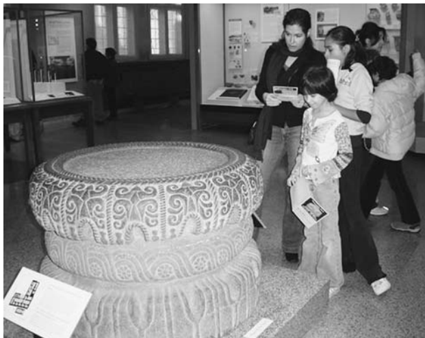
Figure 1. Visitors explore Empires in the Fertile Crescent: Ancient Assyria, Anatolia, and Israel with a special “Treasure Hunt for Families” during the exhibition’s grand opening weekend for the public.