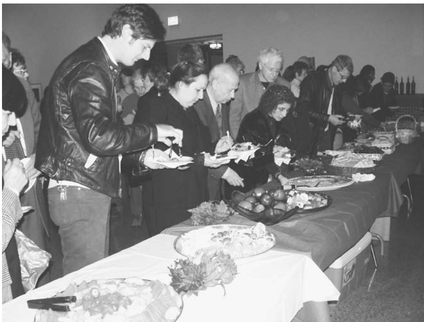
Figure 7. All the guests who attended the Chicago premiere showing of Persepolis: A New Perspective enjoyed a delicious buffet provided by Iran House of Chicago and the Iranian Cultural Society.