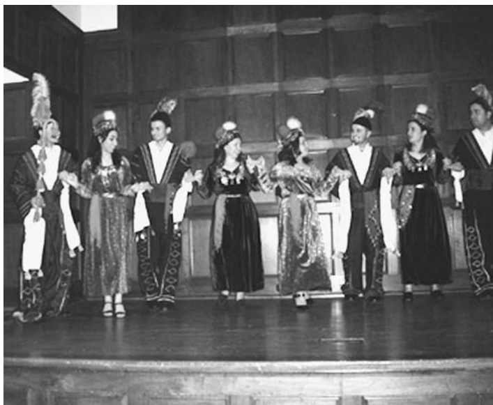
Figure 3. Performing in traditional costume, the Assyrian Hakkery Dance Group brought history and heritage to life in Breasted Hall during the opening of Empires in the Fertile Crescent.