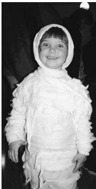
Figure 10. This adorable little girl in her homemade costume stole the show at “Mummy’s Night,” our annual Halloween celebration.