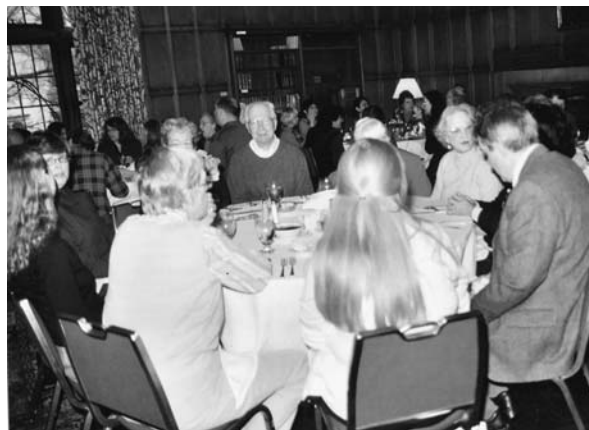
Figure 11. The December Volunteer Recognition Ceremony always ends with a festive luncheon at the Quadrangle Club where docents, faculty, staff, and volunteers all enjoy a meal together