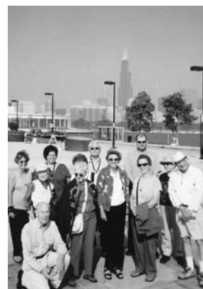
Figure 10. Oriental Institute docents and volunteers pose in front of the magnificent Chicago skyline during their September field trip to see the Stars of the Pharaohs exhibit at the Adler Planetarium

Following Geoff's presentation, the program continued with the introduction of new volunteers and the Recognition Awards