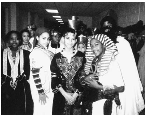
Figure 2. An annual tradition continues at James Hart Millennium School in Homewood, Illinois, where students enjoy an Oriental Institute Outreach visit and dress up like ancient kings and queens