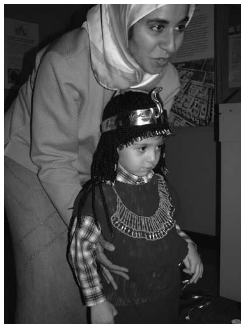
Dressing like ancient Egyptian royalty was a new experience for this shy young visitor during the annual pre-Halloween celebration for families.