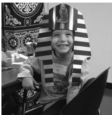
A beaming boy proudly displays the royal headdress he made during the “Meet King Tut” workshop co-sponsored by The Field Museum.