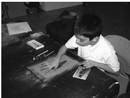
Fiske school student creates a drawing of his favorite ancient Nubian artifact in preparation for the student exhibit that was part of The African Heritage Project .