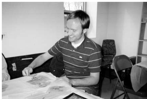
Pounding plant fibers to make papyrus was a special feature during Ancient Arts/Contemporary Artists, an event co-sponsored by The Field Museum and Hyde Park Art Center.