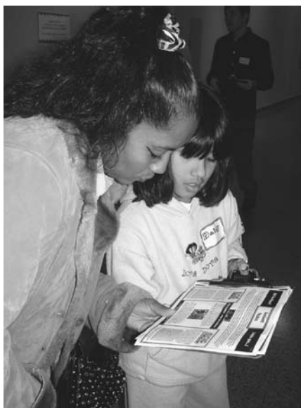
A mother and daughter from Nightingale School test the bilingual prototype Family Activity Cards in the Nubia Gallery. This project is part of Families in the Museum, an initiative supported by the Polk Bros. Foundation.