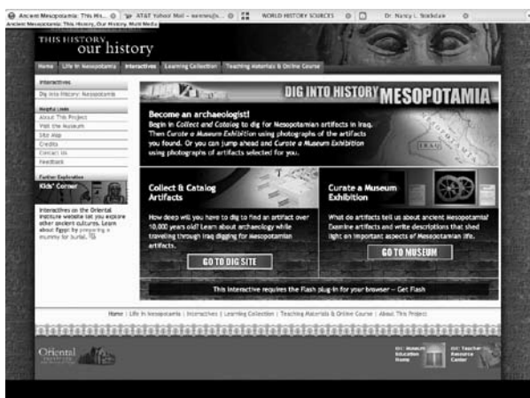
Home page for Dig into History , a simulated archaeological excavation that is part of Ancient Mesopotamia: This History, Our History , a major online project supported by the Institute of Museum and Library Sciences

“The Learning Collection,” launched online in February 2006, was the first project component to be completed. Designed for teachers and students of grades 6–12, it provides a state-of-the-art format for browsing, researching, and interacting with artifacts in a myriad of ways, ranging from zooming in to examine all aspects of an ancient sculpture to “rolling out” a cylinder seal to discover the intricacies and beauty of ancient Mesopotamian art. The production of such a resource was a labor-intensive process that demanded the time, talents, and expertise of a whole host of dedicated people. All the participants, and the entire process, are described in full detail in the Museum Education section of the Oriental Institute’s Annual Report for 2005–2006.