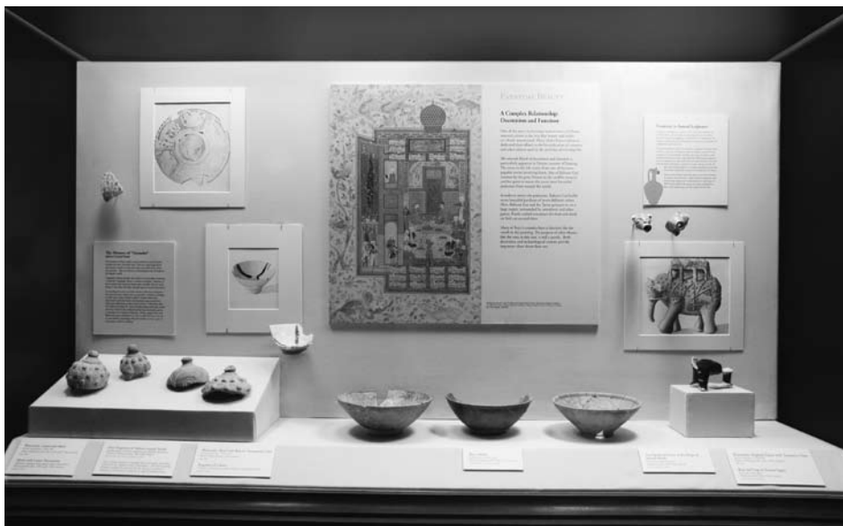
View of the Special Exhibit Daily Life Ornamented: The Medieval Persian City of Rayy

of the Oriental Institute. The beautiful exhibit had a number of good outcomes; it provided a graduate student with valuable curatorial experience and an important and attractive publication, and a great number of previously unaccessioned and unpublished sherds were registered and photographed in preparation for the exhibit.