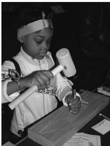
A young visitor tries her hand at working leather like the ancient Nubians during the Awesome Ancient African Arts festival for families.

Docents and interns offered a round of activities that ranged from origami bat-making to a "Guess the Gummy Mummies" contest to dressing up like ancient Egyptians with costumes from "King Tut's Closet." Holiday Adventures, a new initiative for the holiday season, gave us city-wide promotion for a weekend program in December that featured hands-on activities, family treasure hunts, and wonderful shopping opportunities during the Suq's holiday sale.