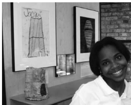
A student from Fiske school proudly displays her drawing and sculpture in the exhibit "Through Young Eyes: Ancient Nubia Recreated" in conjunction with The African Heritage Project .