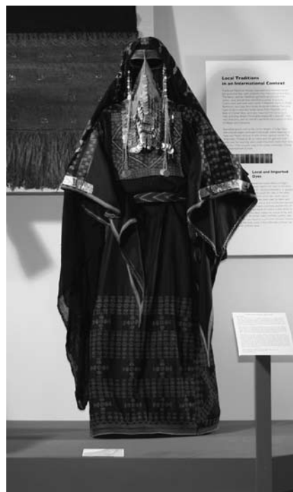
Dress from Bir Sabe (Beersheva) in the exhibit Embroidering Identities: A Century of Palestinian Clothing

It is difficult to summarize the contributions of the Education Department and Volunteer Program in just a few lines because they are both so active, and highlighting one program or another would simply leave others out. I can only recommend their descriptions below.