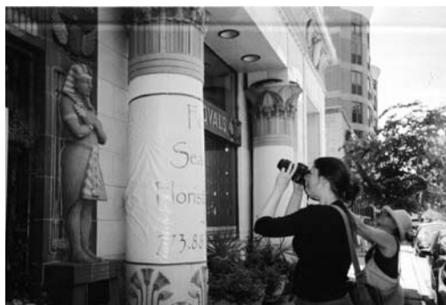
Fascinating examples of Egyptian-style decor inspired many photographs during the Egyptomania, Chicago Style bus tour this past summer.