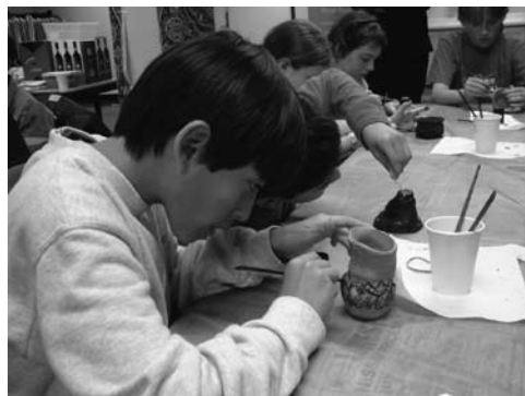
Students decorate pottery with ancient Nubian designs during a museum lesson their teacher created during an Oriental Institute professional development seminar. The seminar and student visit were supported by the Lloyd A. Fry Foundation