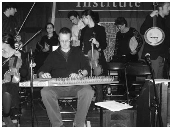
Members of the Middle Eastern Music Ensemble get ready for the concert of Palestinian music held in Breasted Hall.