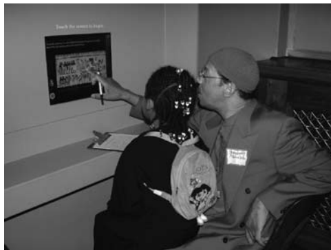
A grandfather and granddaughter from North Kenwood/Oakland Charter School test prototype computer activities for the Nubia Gallery as part of the Families in the Museum project.