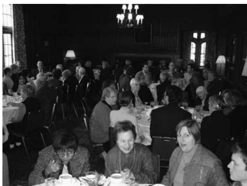
As a yearly tradition, faculty, staff, and volunteers gather to enjoy a festive holiday luncheon at the Quadrangle Club. This year's special event took place on Monday, December 4.