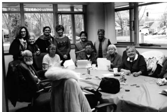
"On the road again" with outreach. Outreach docents pause for a break in the teachers' lounge at James Hart Millennium School during our annual visit.