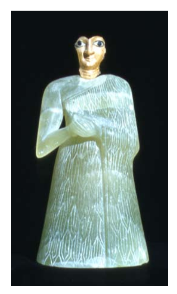
Figure 1. 7N 184, statue of a woman in translucent stone with a gold face. Found at Nippur in Level VIIB, plastered inside a bench. IM 66190. Early Dynastic IIIa

In general, the lack of financial support for the Antiquities officials in various parts of the country means that guards who should be circulating in various areas and checking on sites to prevent looting do not have gasoline for their vehicles and they often do not have the support of the local government officials. This means that the looting of sites, which had gone down a lot in the