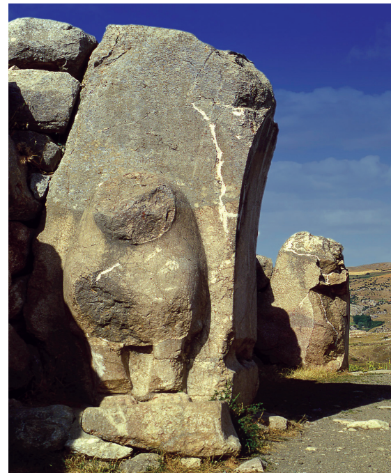
FRONT COVER: Nemrut Dağ – funerary sanctuary of King Antiochus I of Commagene

This morning we drive into the plains of Mesopotamia to Harran, where Abraham stopped on his way from Ur. We will explore the ruins of ancient Harran, known as Carrhae in the Roman period and the place of a decisive battle in 53 BC. We will also visit the unusual "beehive" mudbrick houses of modern Harran.