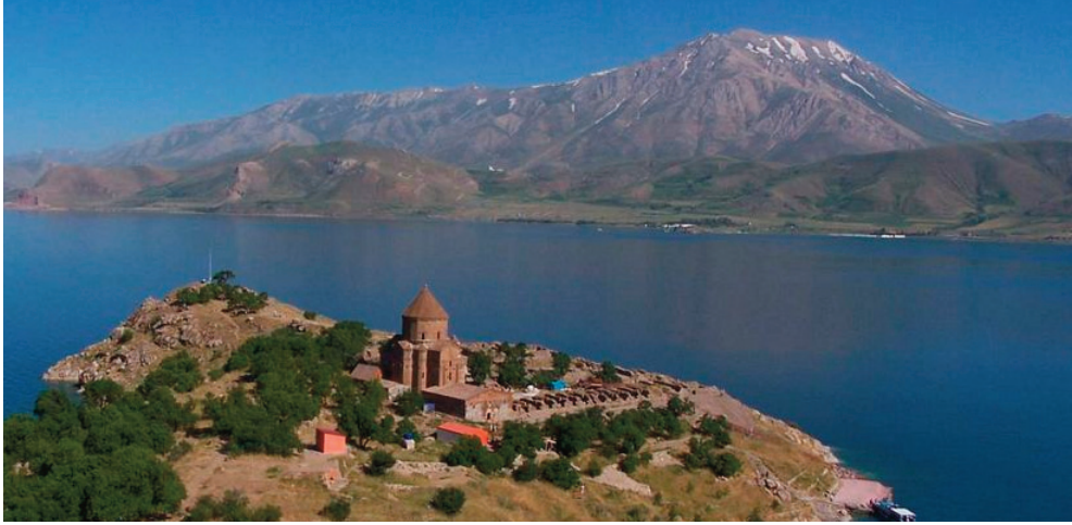
Lake Van, Akdamar Island

After lunch, we will visit the Urfa Museum, which displays the oldest life-size human statue ever found (ca. 9000 BCE), and complete our Urfa touring. We then drive on to Kahta, a small village in the mountain foothills. Our route will be via the new dam, where we will make a brief stop before driving on through the cultivated fields made possible by this dam.