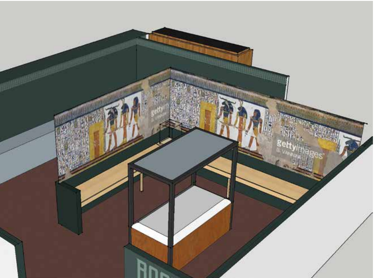
Figure 2. Schematic plan of the Book of the Dead show to open to members on October 1, 2017