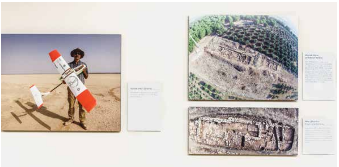
Figure 1a–b. Views of the exhibit, Drones Over the Desert ; D. 29271 (above) and D. 29283 (below)