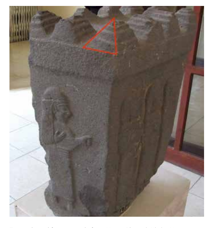
Tower-shaped funerary stela from Maraş.