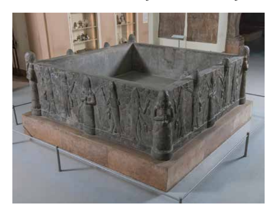
Restored water basin from the temple of Aššur.