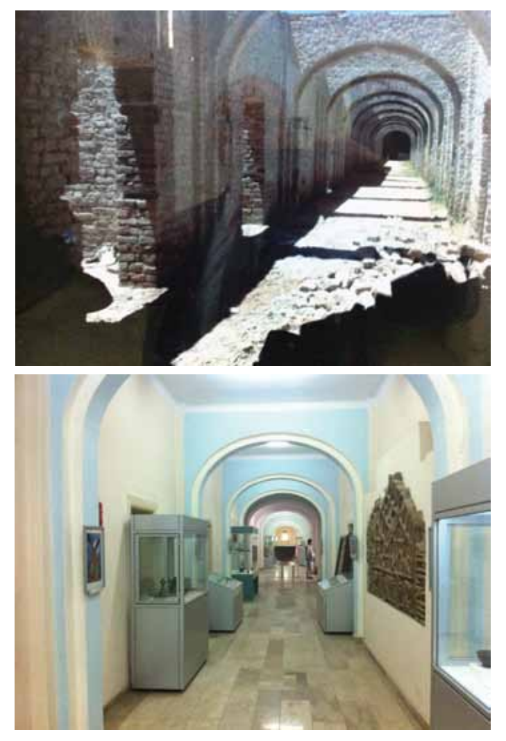
The National Museum of Afghanistan destroyed (above) and rebuilt (below)

For more than half a century, the protection of cultural heritage has been a central part of the Oriental Institute's mission, starting in the early 1960s with the Nubian salvage project, continuing with the restoration work of Chicago House at Luxor, the training of Iraqi and Afghan archaeological conservators at the Oriental Institute in 2007, and numerous other projects up to the present. In May 2012, the Oriental Institute embarked on an important new project of cultural heritage protection — the Oriental Institute's partnership with the