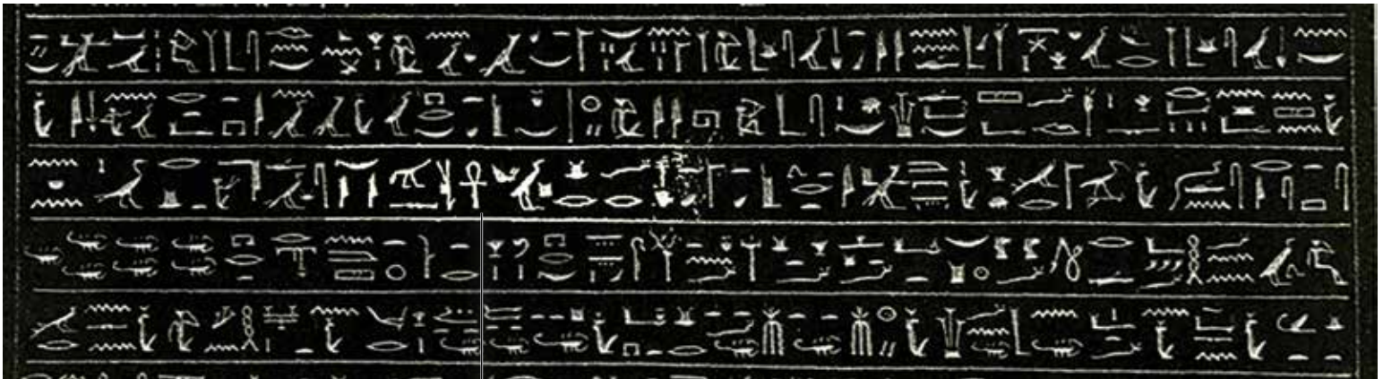
Image and Hieroglyphic transcription of “Furthermore, listening is good. Someone will live when another guides” from the story of Isis and the Noblewoman (Metternich Stela, Metropolitan Museum of Art 50.85)