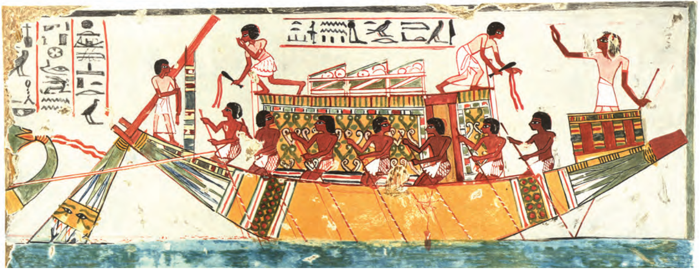
A Nile Boat with Its Crew. Thebes, tomb of Pere (no. 139). Ancient Egyptian Paintings 2 , by Nina Davies (Chicago, 1936), plate 56

The University of Chicago 1155 East 58th Street • Chicago, Illinois • 60637 (773) 702-9514