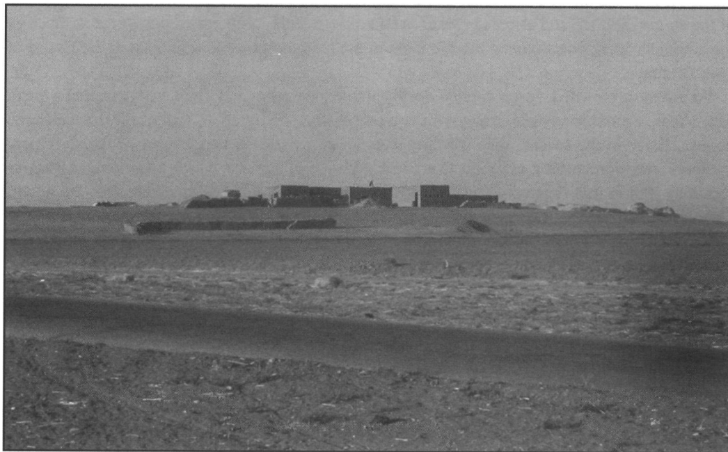
Expedition house being built. Hamoukar

With the house still not ready, we needed a place for the team to stay for the season. We did not want to make the long commute from the nearest town, as we had in the first season. So, after a lot of negotiation, we rented a house in the village on the mound. A village house is actually several buildings. Our house had a main building of four rooms, in which most of the team lived, ate, and worked. There was also another building with a kitchen and one bedroom, where