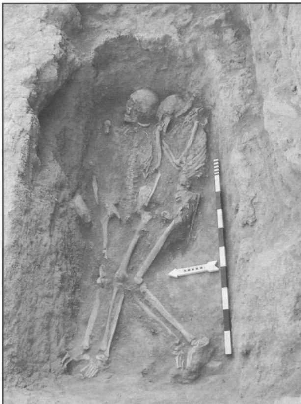
Neo Assyrian burial. Hamoukar