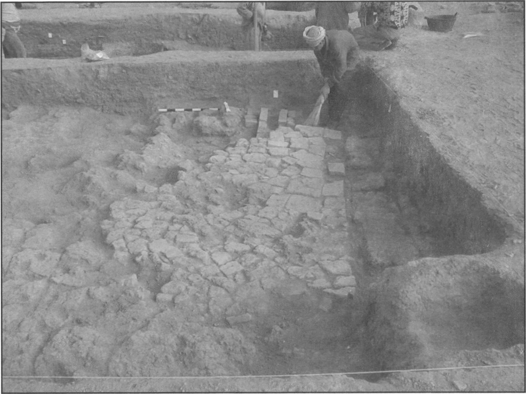
Neo-Assyrian level, one of several pavements. Area C, Hamoukar

the cook and his assistant lived. A separate, more elaborately appointed, one-room building had been the guest house. This entertainment room had green-painted walls and shocking pink drapes. It also had an air conditioner and a sink. Here, we decided to put the computers, because of the air conditioner, and also had two of the men sleep there. As it turned out, about as much of the computer work was done on the big table in the main building as was done in the House of Pink Drapes.