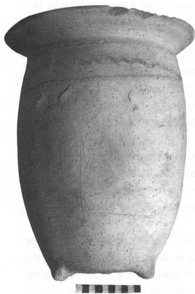
Post-Akkadian pot. Area C, Hamoukar

rary storage of grain. There were also a few Neo-Assyrian pits of similar shape, probably for the same purpose. We encountered several Neo-Assyrian graves, the most important of which had two skeletons. One skeleton was lying on its back and was adorned with jewelry, even a toe ring. The other skeleton was laid on its right side, with its head on the first skeleton's shoulder. Thoughts that these were a man and wife were dispelled by the inclusion of weapons with both skeletons. The complete disintegration of both pelvises prevented us from determining the sex of the skeletons, but we assume that they were both male.