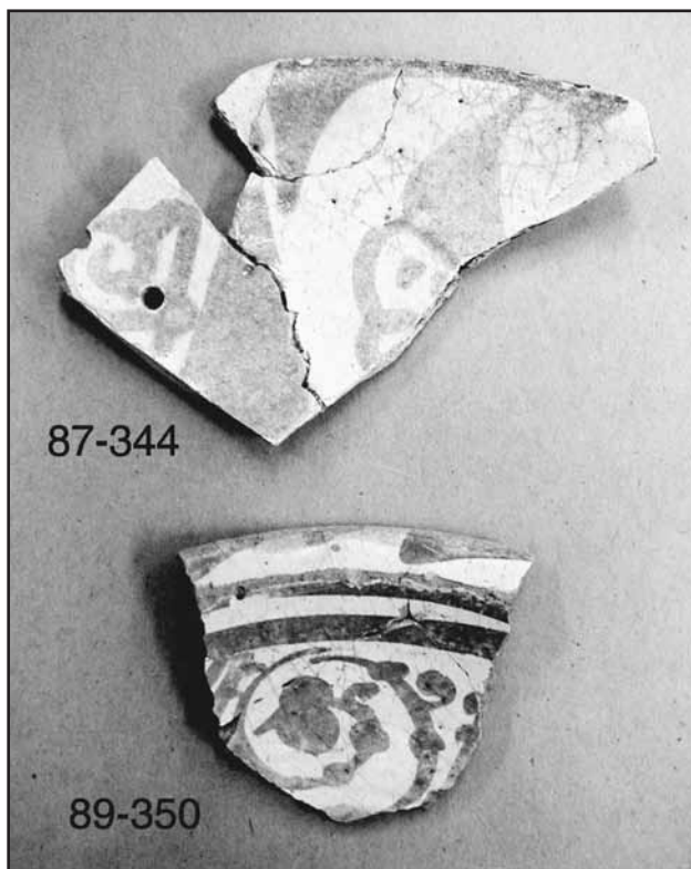
Fatimid lustre ware. Aqaba, Jordan

This last period is that which overlaps with the majority of Geniza documents and shows another example of the complex relationship of textual and archaeological lines of evidence. Interpretation of the archaeological evidence produces a “historical narrative” that may be