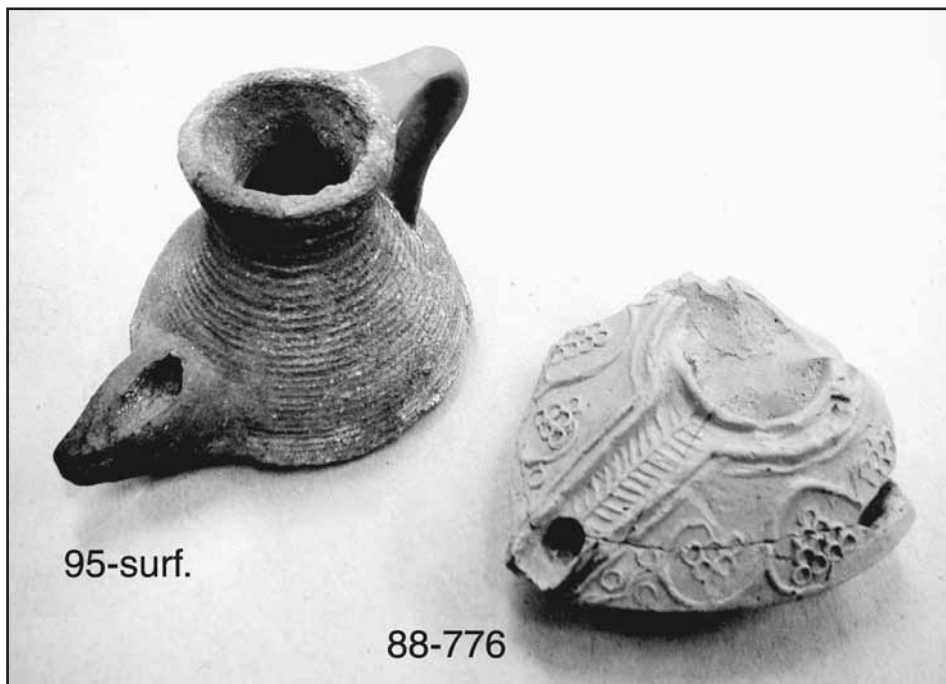
Late Byzantine (left) and Abbasid (right) lamps. Aqaba, Jordan

The Geniza signifies the vast collections of medieval documents known from the Ben Ezra synagogue in Cairo. These testify to the activities of the merchants of Fustat (medieval Cairo), who traveled to the Red Sea and ventured on to India. They mingled with communities in Arabia and the Levant and used Ayla (Aqaba) as one of their principal ports leading to these eastern lands. Beginning in Fustat/Cairo, merchants and pilgrims crossed the Sinai (known