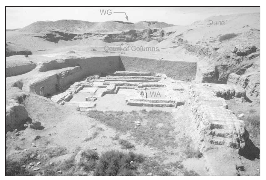
Areas WA, WG, and Court of Columns. Nippur, Iraq

we misjudged the ability of the car to ride over a low dune, but the key to getting out was to have a shovel to remove the sand from around the wheels and enough passengers to give a good push. By 1980, our drive through the dunes was much easier because the entire belt was moving progressively north and east, and the western fringe that had overlain all of Nippur was now more than a kilometer north and east of the site. A few remnant dunes still remained in low spots on the site, but we were virtually free of sand.