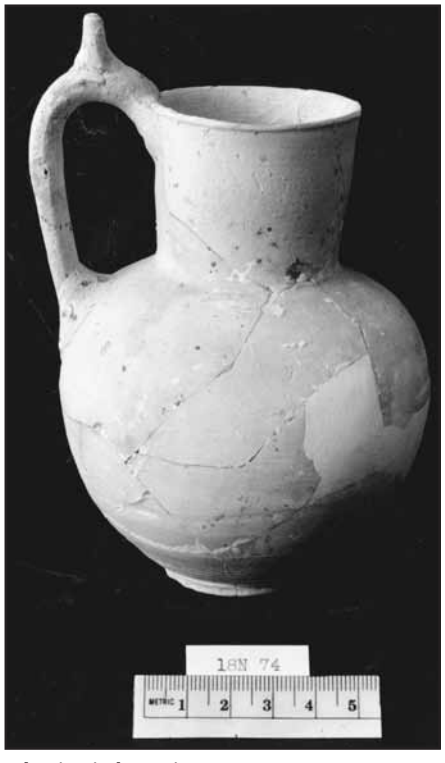
Islamic pitcher. Nippur, Iraq

they were completely covered. When we began digging in WA seven years later, I was surprised not to see the columns, and I became convinced that someone, maybe one of the guards, had taken the bricks to use in the repair of a house. But, now, here was the Court of Columns once again. Although the dune had moved off the Court of Columns, it still lay over most of WA, deeper down. Being a deep hole, the sand tended to lodge there, and the winds that had taken the rest of the dunes from the site would only occasionally dip down into WA and remove sand. But enough of the sand had been removed from the entire area to show that Pennsylvania's previous work and a gully or two furnished us with a space of about a hundred meters by a hundred meters in which to work. If we could dig this entire area systematically, level by level, we would be able to show not only how the temple changed through time but also its relationship with its immediate surroundings. We had been able to expose a few rooms of the temple in a number of periods in previous seasons and knew already that there were remains of six re-buildings stacked on one another. These versions of the temple, from the top one down, were datable to the sixth century (Neo-Babylonian/Achaemenid), seventh century (Assyrian domination), Kassite (ca. 1250 BC), Old Babylonian