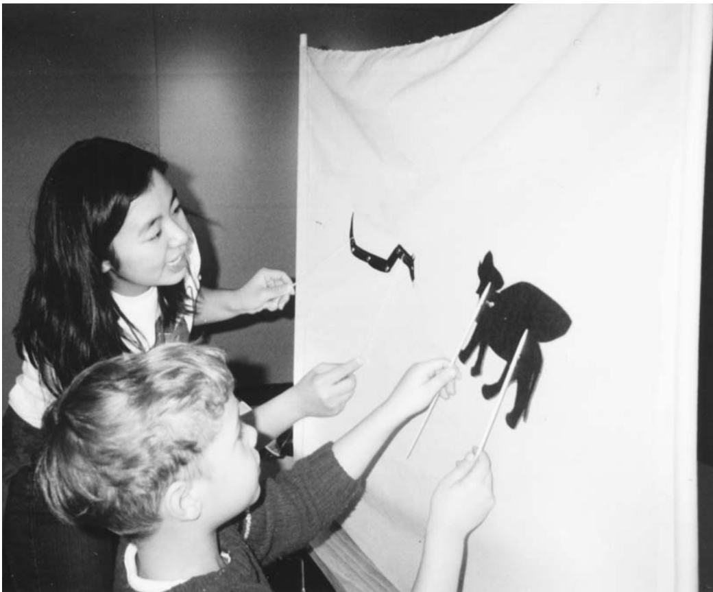
Making shadow puppets based on traditions from Turkey was the highlight at an Oriental Institute workshop for families.