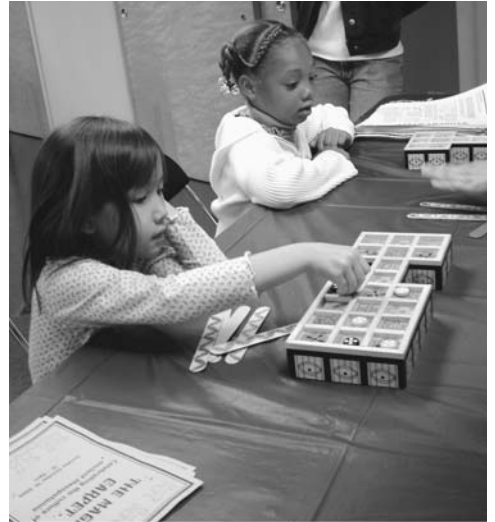
Children learn how to play the ancient Royal Game of Ur during the weekend celebration that opened the new Mesopotamian Gallery.