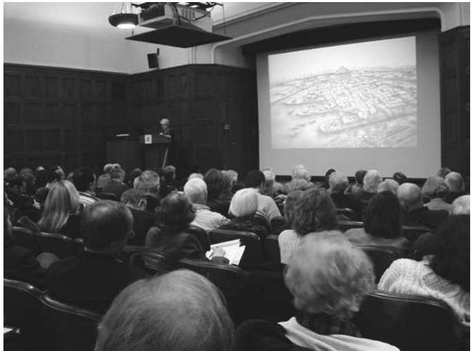
Nearly 200 people attended “Mesopotamia: Cradle of Civilization,” a day-long symposium featuring a prestigious panel of Oriental Institute faculty and guest lecturers. Held in Breasted Hall, this program was supported in part by the Norman Wait Harris Memorial Foundation Fund.

More drop-by tours took place in conjunction with the University of