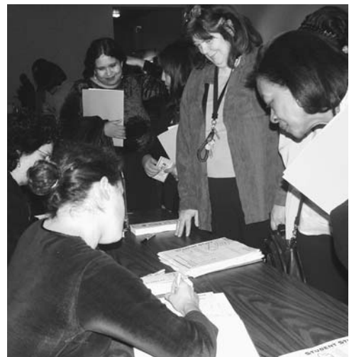
Teachers are fascinated to see their names written in cuneiform script during an Educators' Open House for the new Mesopotamian Gallery.