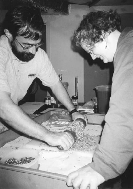
Crushing grain was a key step in the process for "Brewing Ancient Beer," a course where students created — and then sampled! — their own versions of an ancient Sumerian libation.