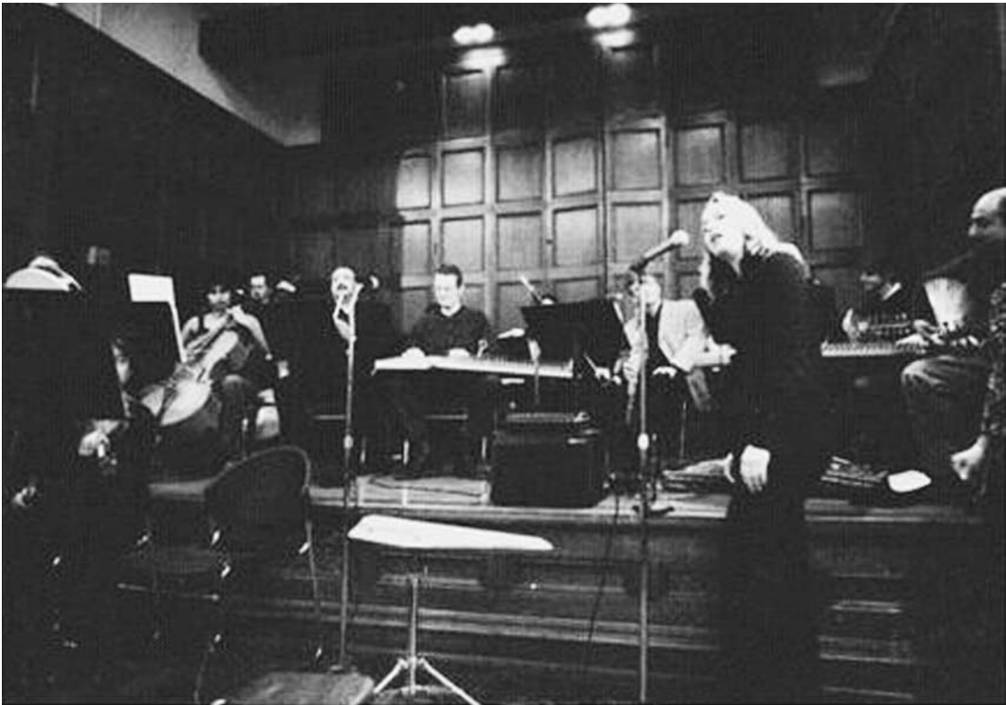
The University of Chicago's Middle East Music Ensemble filled every seat in Breasted Hall during a dazzling performance of instrumental and choral music co-sponsored by the Oriental Institute.