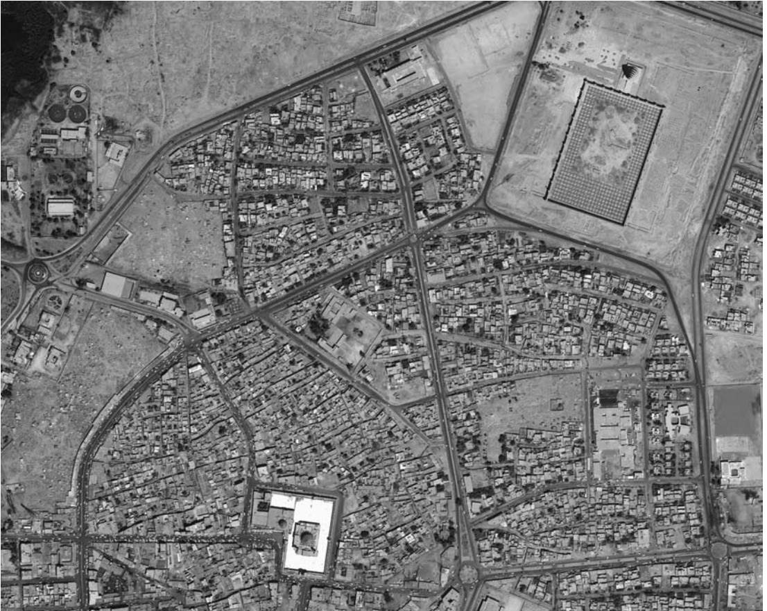
Portion of a Quickbird Image of Samarra. To the south is the al-Askari (or Golden) mosque prior to the February 22 bombing.

only the first year, we can see ourselves already well on our way to becoming a major resource for those with interests in the various landscapes of both the ancient and modern Middle East.