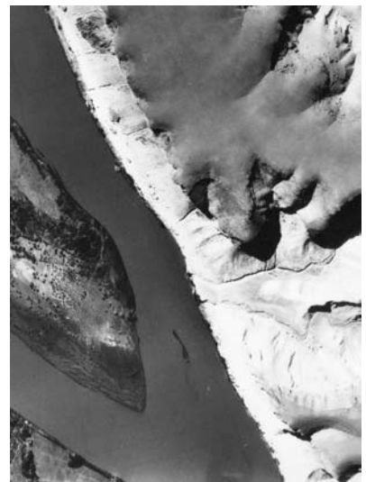
Portion of an aerial photo of the Euphrates in the Institute's collections, taken on May 4, 1961