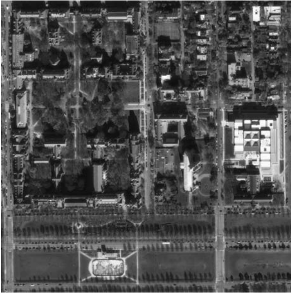
Portion of a donated Quickbird image of the University of Chicago showing the Oriental Institute.

holdings but also the invaluable data collected over the past one hundred years by the Institute’s researchers and staff.