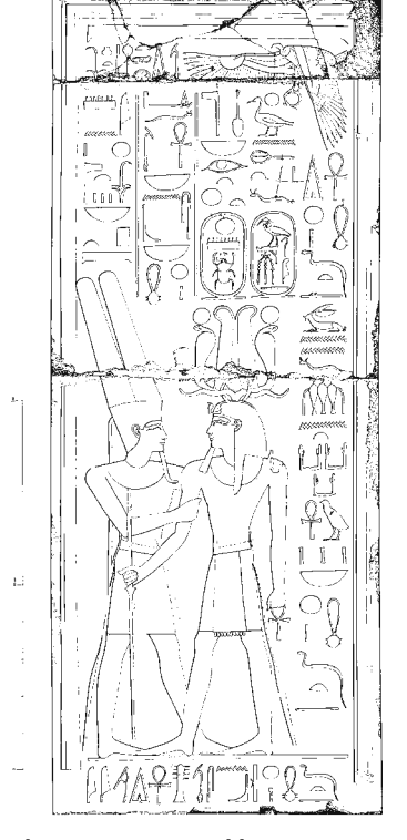
Thutmose III greeted by Amun, east pillar face from facade of the Small Amun Temple. Drawing by Will Schenck and Susan Osgood

Lotfi Hassan, Adel Azziz, and the conservation team (including four local Egyptian conservation students this season) extended the consolidation of the deteriorating exterior walls of the Eighteenth Dynasty sanctuary along the northern, western, and southern sides, where the decay due to groundwater salts was found to be extreme. Old mortar infill was removed and replaced with new breathable lime mortar, and in some cases radically decaying stone was reinforced with Wacker OH 100 silicate. In the case of the northeastern outer wall section, three sandstone slabs ( 96 \times 86 \times 21 cm; 80 \times 86 \times 21 cm [in two sections]; and 98.5 \times 86.0 \times 21.0 cm [in two sections]) were inserted to replace the totally decayed stone by mason Frank Helmholz working closely with Lotfi. Pho-