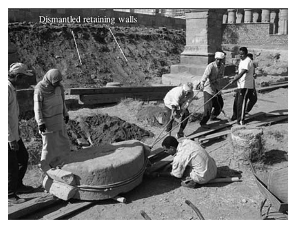
Moving fragmentary material from the east Roman gate area into the Luxor Temple blockyard.

A five-year plan (three years for the first phase and two years for the second phase) of an open-air museum for the Luxor Temple blockyard was developed by Hiroko and Nan this winter, part of which will be supported by the World Monuments Fund (WMF) starting in the 2007/2008 season. The museum will be constructed with sandstone walkways that will direct visitors along the eastern side of Luxor Temple from the sanctuary to the Colonnade Hall. Using blocks and reassembled fragment groups from the blockyard, it will feature a chronological, art historical, and stylistic chain of examples from the Middle Kingdom through the Islamic period. Informative, per-