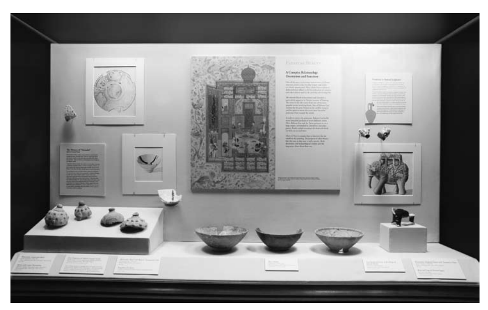
View of the Special Exhibit Daily Life Ornamented: The Medieval Persian City of Rayy

of the Oriental Institute. The beautiful exhibit had a number of good outcomes; it provided a graduate student with valuable curatorial experience and an important and attractive publication, and a great number of previously unaccessioned and unpublished sherds were registered and photographed in preparation for the exhibit.