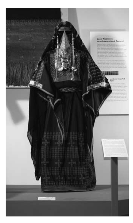
Dress from Bir Sabe (Beersheva) in the exhibit Embroidering Identities: A Century of Palestinian Clothing

These exhibits provided opportunities for Oriental Institute faculty, research associates, and staff to present their work, both in the exhibits themselves and in the catalogs we have produced for the exhibits, and we hope to continue these collaborations in the future. The exhibits have presented opportunities for a wide range of education programs and activities, which have enriched the exhibits beyond the displays themselves. And it must be said that these exhibits kept the museum staff extremely busy.