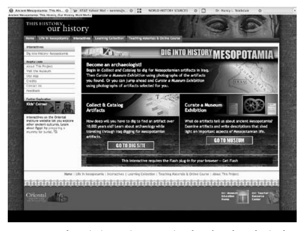
Home page for Dig into History, a simulated archaeological excavation that is part of Ancient Mesopotamia: This History, Our History, a major online project supported by the Institute of Museum and Library Sciences

"The Learning Collection," launched online in February 2006, was the first project component to be completed. Designed for teachers and students of grades 6–12, it provides a state-of-the-art format for browsing, researching, and interacting with artifacts in a myriad of ways, ranging from zooming in to examine all aspects of an ancient sculpture to "rolling out" a cylinder seal to discover the intricacies and beauty of ancient Mesopotamian art. The production of such a resource was a labor-intensive process that demanded the time, talents, and expertise of a whole host of dedicated people. All the participants, and the entire process, are described in full detail in the Museum Education section of the Oriental Institute's Annual Report for 2005–2006.