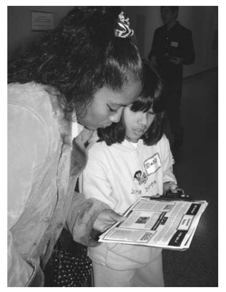
A mother and daughter from Nightingale School test the bilingual prototype Family Activity Cards in the Nubia Gallery. This project is part of Families in the Museum, an initiative supported by the Polk Bros. Foundation.

Polk Bros. Foundation support from 2000 to 2003 enabled us to create a rich array of self-guided activities for the Egyptian and Mesopotamian Galleries. This success inspired the foundation to award the Oriental Institute a new two-year grant