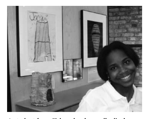
A student from Fiske school proudly displays her drawing and sculpture in the exhibit "Through Young Eyes: Ancient Nubia Recreated" in conjunction with The African Heritage Project.