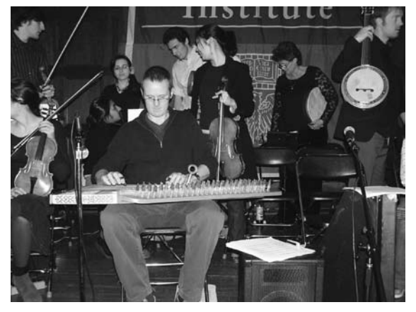
Members of the Middle Eastern Music Ensemble get ready for the concert of Palestinian music held in Breasted Hall.

Collaborations inspired by the special exhibit Embroidering Identities: A Century of Palestinian Clothing included partnerships on campus and with the city of Chicago. In conjunction with Arab Heritage Month in November the University of Chicago's Middle East Music Ensemble came to the Oriental Institute to present a special concert of historic and contemporary Palestinian music. Visitors