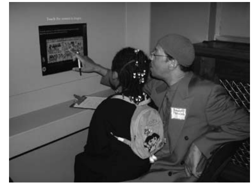
A grandfather and granddaughter from North Kenwood/Oakland Charter School test prototype computer activities for the Nubia Gallery as part of the Families in the Museum project.

The outcomes of this process are rich and rewarding. Museum visitors can now explore and make discoveries about artifacts in the Empires exhibit and Nubia Gallery using full-color Family Activity Cards in English and Spanish. We have also produced a broad spectrum of exciting and instructive "hands-on" computer activities