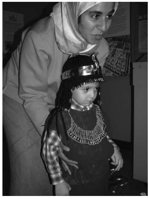
Dressing like ancient Egyptian royalty was a new experience for this shy young visitor during the annual pre-Halloween celebration for families.