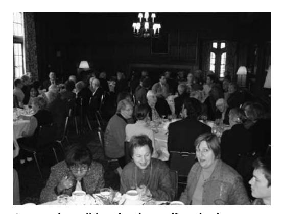
As a yearly tradition, faculty, staff, and volunteers gather to enjoy a festive holiday luncheon at the Quadrangle Club. This year's special event took place on Monday, December 4.