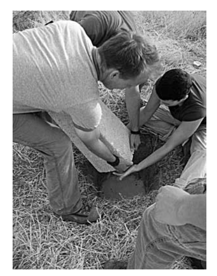
The Zincirli Expedition team placing a concrete survey marker on the site during the 2006 season. Seventeen survey markers were placed on and around the site and their precise locations — accurate to one centimeter horizontally or vertically — were determined using GPS satellite readings

to a variety of cultural influences and population movements by virtue of its location in a pivotal border zone between Syria, Anatolia, and Mesopotamia. In the Iron Age, in particular, the valley around Zincirli was home to Luwian-speaking people from Anatolia, who were in many respects the heirs of Bronze Age Hittite culture, and to Aramaic-speakers who had apparently migrated into the region from the south and east. At Zincirli, we hope to examine the cultural and political interaction of these two groups from the perspective of their art, architecture, diet, and lifestyle.