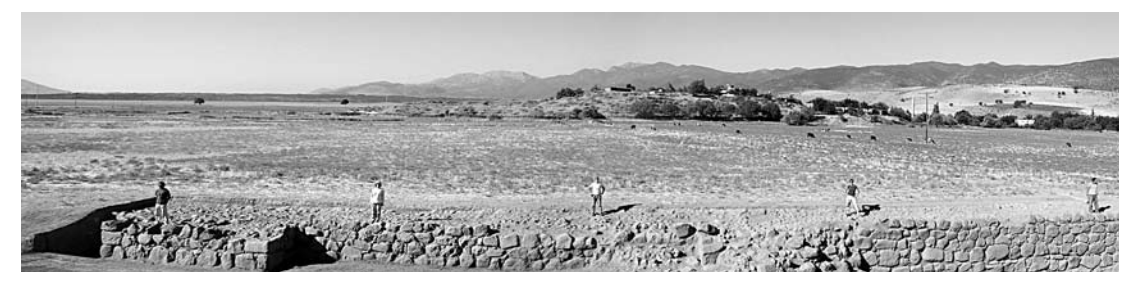
A 45-meter-wide portion of the outer city wall of Iron Age Sam'al was exposed on the northeastern side of the city during the 2006 season. The basalt stonework of the wall is 3 meters wide and 3.2 meters high. Two of the wall's 100 towers are visible in this exposure. One of the towers has partly collapsed subsequent to its initial exposure by German archaeologists in the 1890s

During our 2006 season, we established seventeen precisely georeferenced inter-visible survey markers on and around the site (using differential GPS equipment) and we conducted a thorough topographical survey of the mound. In the process of doing this, we located the previously excavated corner stones of several structures around the site that are still visible in the old German trenches. This allowed us to georeference the published plans of the site within our own coordinate system. We were happy to learn that the old plans are quite accurate, with careful stone-by-