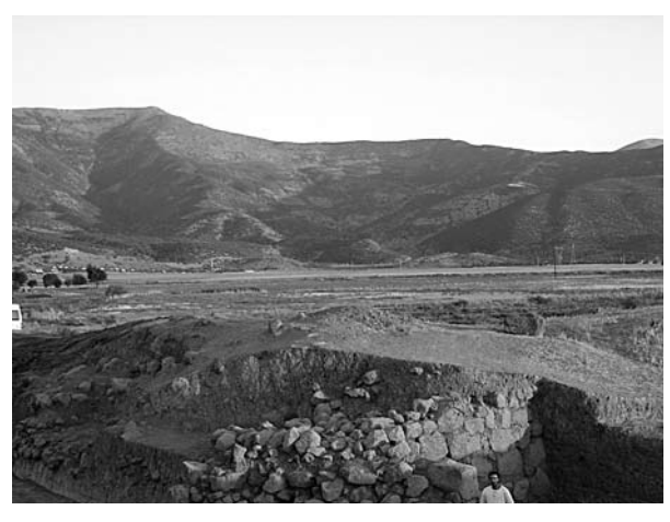
A modern canal has cut through the Iron Age city wall on the southeastern side of the site. Although it is unfortunate that the site has been damaged by this canal, it affords an opportunity to see a cross section of the fortifications, revealing both the outer wall and a matching inner wall that forms a concentric ring 7 m inside the outer wall

In addition to topographical mapping, in 2006 we excavated the outer city wall in two areas: near the northeast gate and on the southeast side, where a modern canal had cut across the wall. In the northeast area, we exposed 45 m of the outer face of the wall in order to examine the preserved basalt stonework, which is 3.2 m high and 3 m wide. Two of the 100 projecting towers,