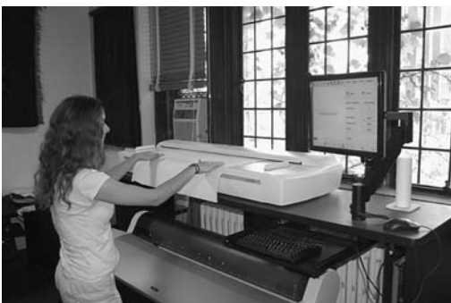
Digitizing the Oriental Institute's vast collection of historic and modern maps is one of the many projects of the Center for Ancient Middle Eastern Landscapes (CAMEL)