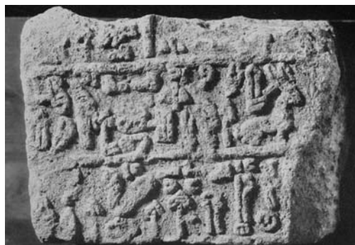
The Oriental Institute is home to the most comprehensive program for the study of Hittitology in the world