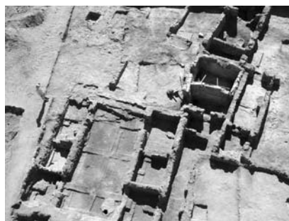
Archaeologists at the site of Hamoukar, Syria, investigate the origins of cities and warfare in ancient Mesopotamia