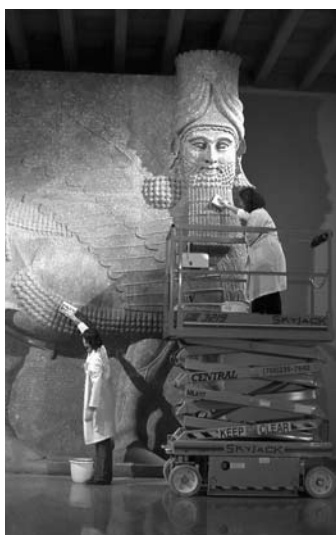
The over 150,000 registered objects in the Oriental Institute Museum hold extraordinary importance for researchers