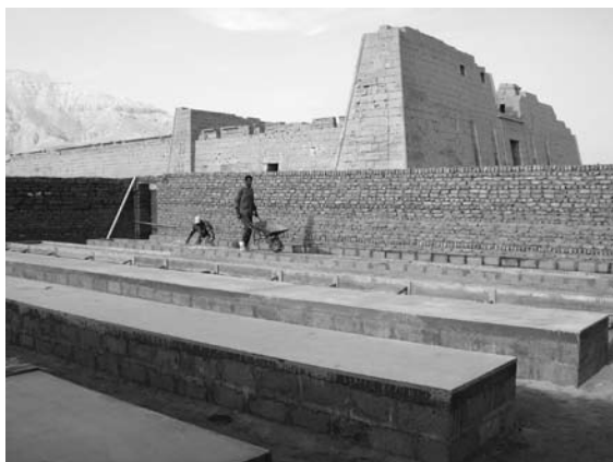
Figure 8. New Medinet Habu blockyard under construction.