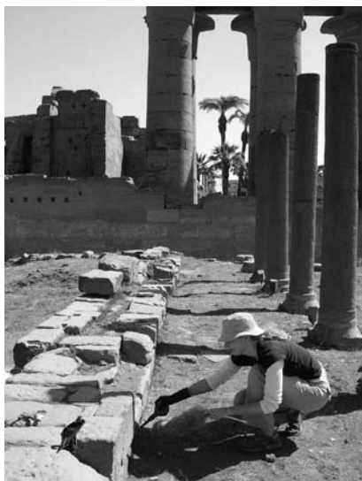
Figure 13. Sylvia Schweri cleaning the west medieval foundation.

conducted a condition survey of two of the few surviving medieval foundations in the precinct, a church foundation to the west of the Colonnade Hall, and another to the north of the eastern Luxor Temple pylon tower. Both foundations are constructed of reused pharaonic sandstone blocks (many quarried from Karnak), some of which are suffering increasing decay from groundwater salts. The conservators mapped every stone in the foundations and condition-surveyed each one, while Yarko photographed the foundation context as well as individual stones. While total dismantling, conservation, and reassembly either in the old or new stone was considered, the conservators recommended that instead we very carefully map and plan every stone and architectural detail in the structures, spot treat decaying individual stones in situ where possible, and preserve the foundations intact (fig. 13). As part of an ongoing collaboration with Chicago House on conservation projects in Luxor Temple, ARCE will sponsor an architectural study and intensive mapping project on the two foundations in the coming year.