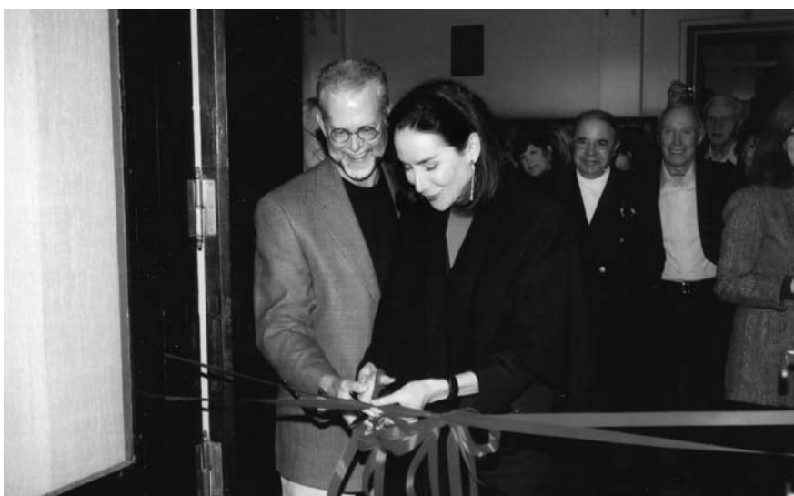
Figure 14. Marjorie M. Fisher Library dedication.