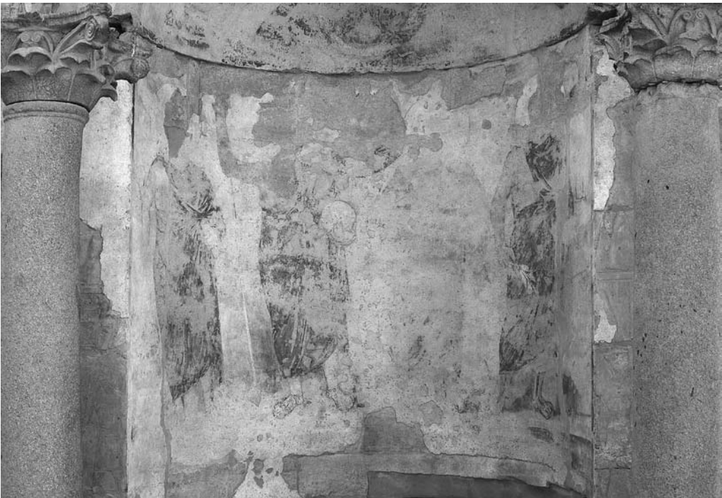
Figure 12. Detail of cleaned apse with Roman emperors.

century A.D.: the two emperors of the east and west, Diocletian and Maximian (in the center of the apse), flanked by their seconds in command/successors (referred to as Caesars) Galerius and Constantius. The toga-clad bodies of three of the figures, despite the damage, are well preserved, particularly the sandaled feet, but the faces have been carefully hammered away, probably in the Christian period, leaving holes in the plaster (although their yellow halos/nimbi indicating their divinity are untouched) (fig. 12). Cleaning showed that one figure in the center right had been completely erased in antiquity and was probably the figure representing Maximian, with whose family Constantius later had problems. This figure represents a late Roman damnatio memoriae eerily reminiscent of the much earlier fate of Amun in the same chamber at the hands of Akhenaten's agents. Perhaps even more representative is a figure of Jupiter originally painted between and behind the two Emperors in the center of the apse, completely hacked away except for the tips of two leaves from his laurel crown. On-site discussions between ARCE, Chicago House, and the SCA were held this spring to determine the best way to protect the cleaned frescos with roofing for that part of the temple.