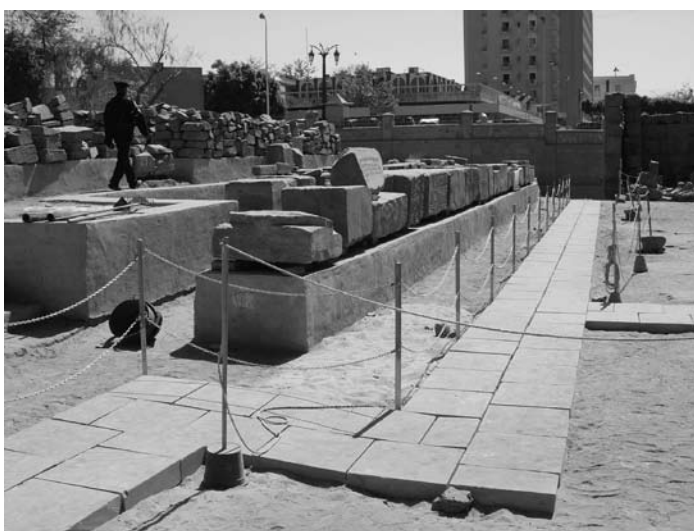
Figure 9. Open-air museum, southern walkway, Luxor Temple blockyard.

century A.D. The stone paving runs a meter from the edge of the display platforms to keep people from touching the assembled wall reliefs; the space between the platform and stone pavement is filled with gravel (fig. 9). The next two seasons will see the installation of additional sandstone paving and protective chain fencing along the entire length of the Amenhotep III solar court on the east, where visitors and tour groups will be directed when they pass out of the Luxor Temple sanctuary. As they walk along the path they will see dozens of reassembled fragment groups, blocks, and even sculpture (including sphinxes) arranged chronologically. At the north end of the path they will be directed back into the court where they will progress out of the temple via the Colonnade Hall, but not before they have passed a display explaining the conservation work and why it is necessary. The open-air museum is projected to be completed in 2010 and will mark another milestone in the history of the Epigraphic Survey at Luxor Temple.