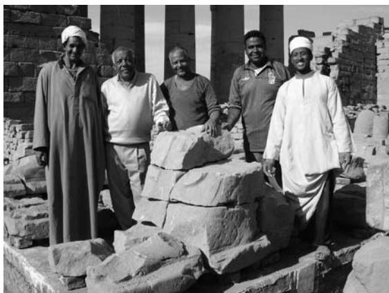
Figure 10. Nectanebo I sphinx assembly crew.

Hiroko and Tina also supervised the construction of 70 m of small-fragment storage shelving along the inside of the eastern block-yard perimeter wall and oversaw the creation of eight new damp-coursed storage mastaba/platforms for fragmentary material recovered in previous seasons from the eastern garden and eastern Roman gate area. Three large 6 × 6 m square platforms were designed specifically for the restoration of sphinxes of Nectanebo I from the Karnak/Luxor sphinx road (fig. 10). These had been quarried in the medieval period, broken up into several hundred pieces, and reused in a foundation that reinforced the north bastion of the eastern Roman gate. Analysis of the sphinx material