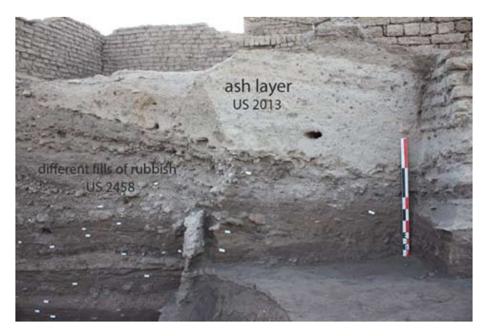
Figure 2. Refuse layers of the New Kingdom

reliable archaeological contexts are extremely rare, especially for the period in question.