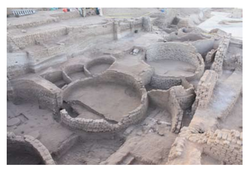
Figure 1. Tell Edfu excavation area in 2009

Last season, we received eagerly awaited official permission from the Supreme Council of Antiquities (SCA) to fully excavate and remove the walls that were built into the thick ash layer covering our excavation area (fig. 1). These walls lay above the granaries and were excavated in 1923. A photograph taken in 1928 from the top of the temple pylon clearly shows the ash layer and the small square silos that were built into it. A comparison with photos taken from the