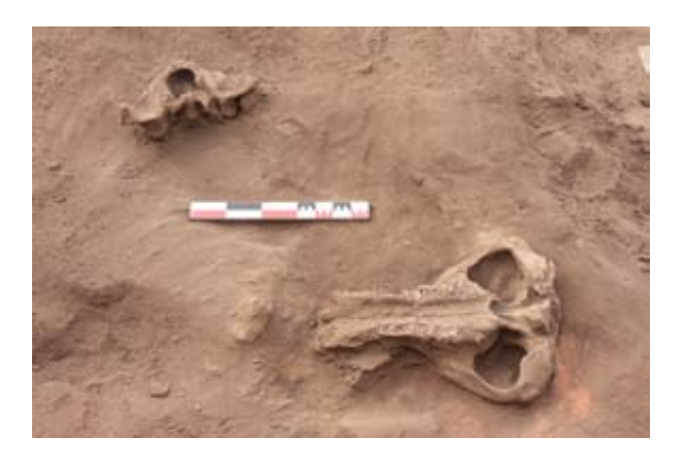
Figure 3. Hippopotamus upper skull and vertebra discovered near the silos

A large quantity of animal bones was also excavated this year. Of particular note are the bones of several hippopotami. An entire upper skull (fig. 3) has been discovered in the area immediately east of Silos 405 and 303. Additionally, multiple pieces of jawbones, tusks, vertebrae, and leg bones have been found in different contexts in the silo area, some in the debris layers of the New Kingdom, others in earlier fill layers near the silos. The exact reason for them being deposited here and the puzzling fact that there is more than one occa-