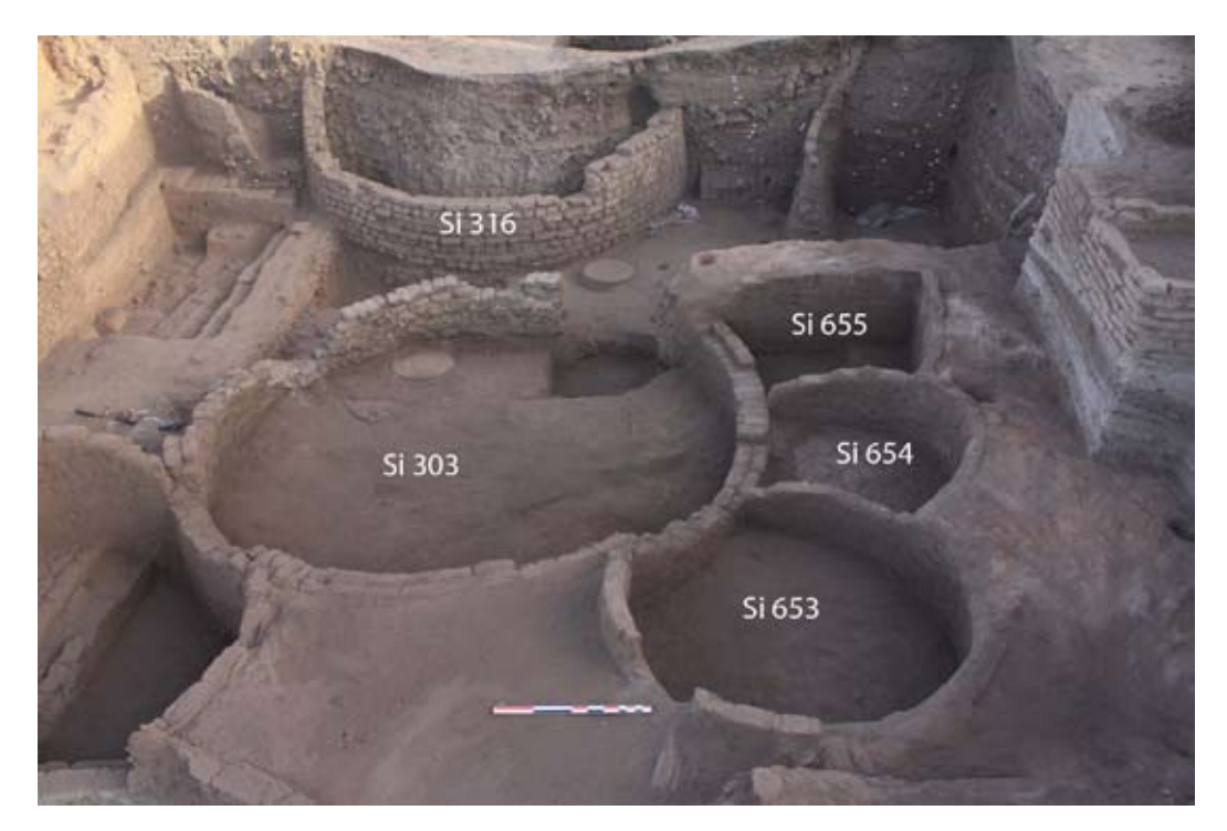
Figure 7. Silos 653, 654, and 655 built against the exterior of Silo 303