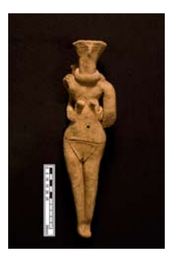
Figure 8. Clay fertility figurine found inside the silo demolition layer

388 is still preserved to a height of more than 3 m above floor level, and the curvature of the dome is easily visible, yet very fragile. This silo seems to have also been previously excavated, probably by the French in the 1920s or 1930s because it was filled with excavation debris.