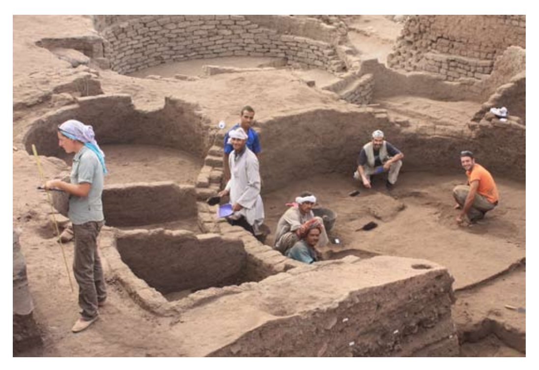
Figure 6. Excavation in progress inside Silo 303