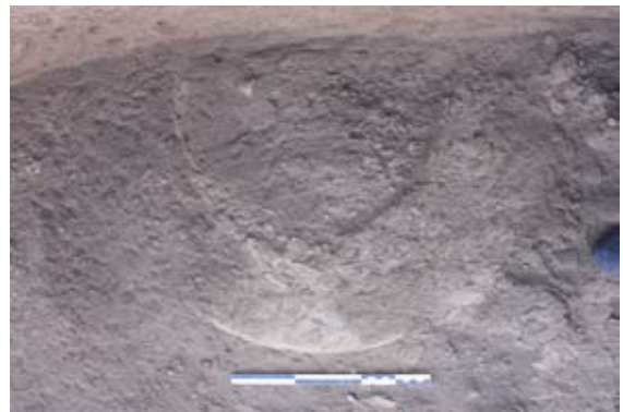
Figure 11. Pieces of Levantine Painted Ware jug found in the columned hall abandonment layer