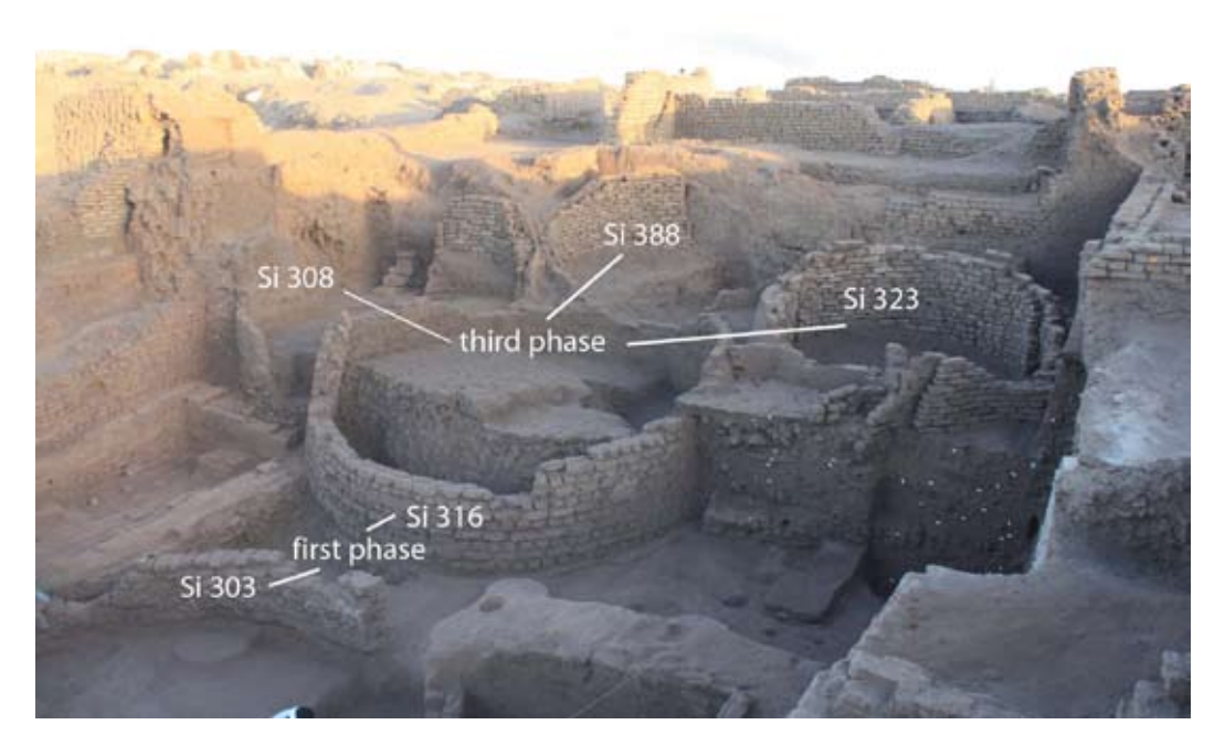
Figure 9. Silos in the northern part of the excavation area

Silo 388 could well be contemporary with the construction of the eastern Silo 323 and/or Silo 313. We cannot establish a precise relative chronology just yet since we are still missing some stratigraphic links in this area, which will be brought to light in excavation next season. Thus the floor of Silo 388 had not been reached by the end of this season, and it is one of the aims for 2010. This silo had been built at a time when the grain storage area was restructured. The main visible transformation was a considerable reduction of the size of the grain silos. In fact, in the north a 2.2 m high wall running east-west was constructed, reducing the extension of the silo court toward the north. A part of another silo wall can be seen that was integrated into this wall. This shows us not only that in its original layout the granary courtyard stretched farther in that direction but also that the latter silo could well have been contemporary to Silo 316 and Silo 303 since it shares identical architectural features.