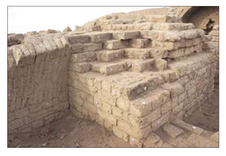
Figure 14. Lower part of a Ptolemaic house showing reference markers used for 3-D modeling

that was excavated by the Franco-Polish mission in the 1930s and is still preserved in excellent condition (fig. 14). One of the challenges was to find the best possible reference markers, which are used for the automatic alignment of photographs to create a 3-D photo skeleton for extracting point-cloud data. In the field the local conditions such as strong sunlight created inevitable shadows, and the winds and the occasional roaming of wild dogs provided quite a few challenges. Another study sample was the female fertility figurine with the baby on her back. The processing of this data and the final generation of the 3-D models are currently in progress. Two other