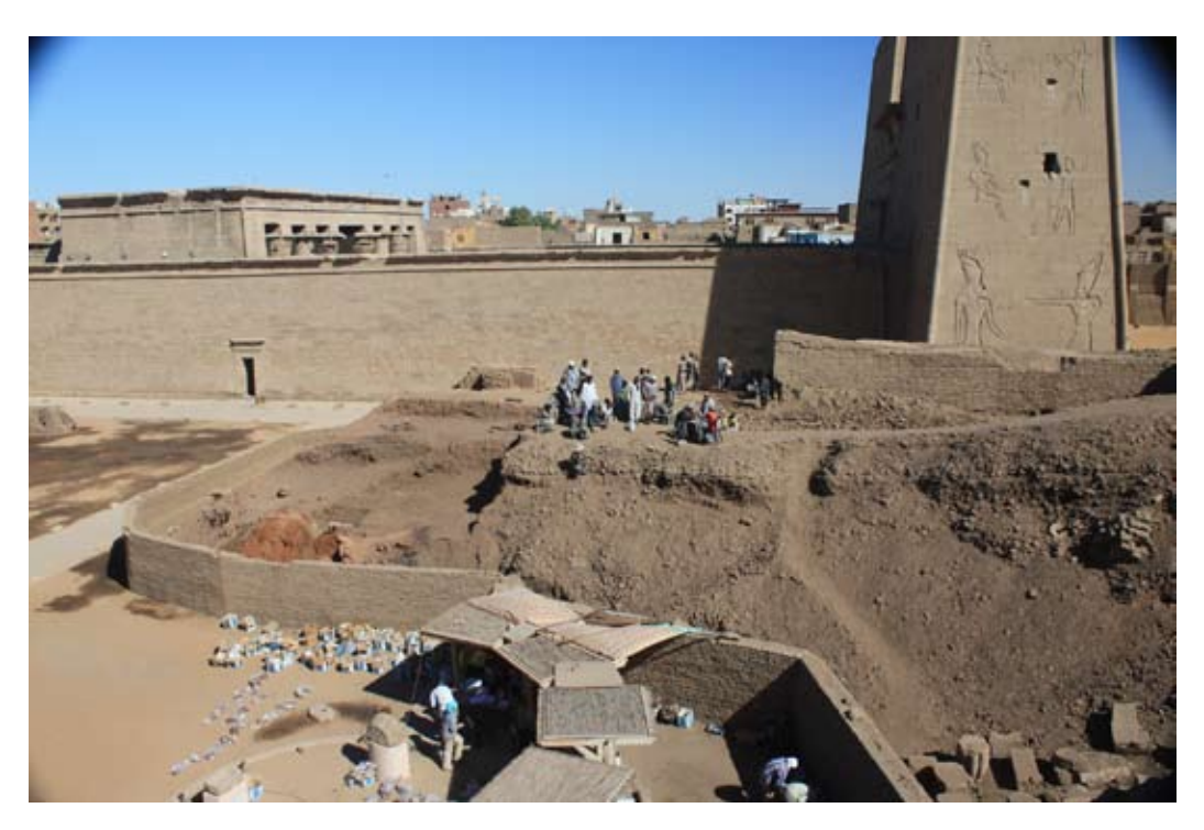
Figure 13. Work in progress during preparation of new excavation area

that was excavated by the Franco-Polish mission in the 1930s and is still preserved in excellent condition (fig. 14). One of the challenges was to find the best possible reference markers, which are used for the automatic alignment of photographs to create a 3-D photo skeleton for extracting point-cloud data. In the field the local conditions such as strong sunlight created inevitable shadows, and the winds and the occasional roaming of wild dogs provided quite a few challenges. Another study sample was the female fertility figurine with the baby on her back. The processing of this data and the final generation of the 3-D models are currently in progress. Two other