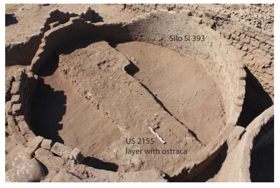
Figure 5. Layer with hieratic ostraca inside silo Si 393

to those found in the northern part of the site (layer US 2458) according to their paleography, suggesting that these pieces come from the same source and period, probably belonging to an archive that was discarded when the administrative buildings in this area were abandoned. Among the ostraca three shallow red bowls were found, broken into multiple pieces, which have been inscribed on the inside and outside in hieratic. These texts will be part of a detailed study by Kathryn Bandy (graduate student in the Department of Near Eastern Languages and Civilizations at the University of Chicago).