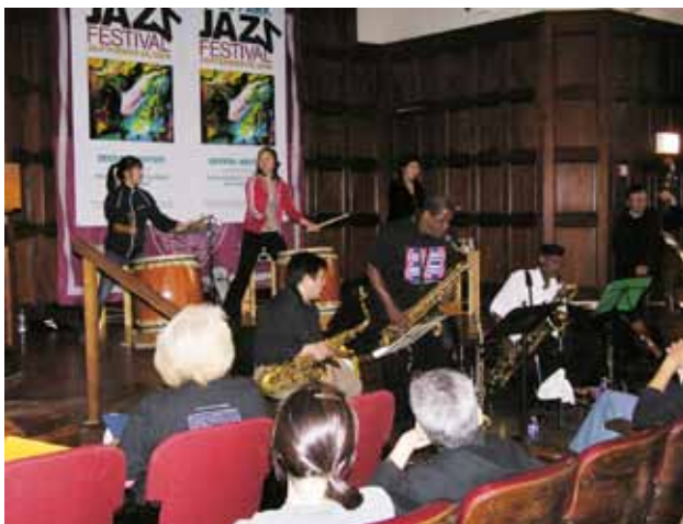
Figure 13. The Tatsu Aoki Ensemble filled Breasted Hall with an amazing fusion of ancient Japanese music and American jazz sounds during the Hyde Park Jazz Festival.

filled every chair in Khorsabad Court for two concerts in that magnificent and acoustically perfect setting. All told, these concerts attracted more than 500 visitors. Most asked to be signed up for the E-Tablet and are now regularly receiving program information, news, and membership information.