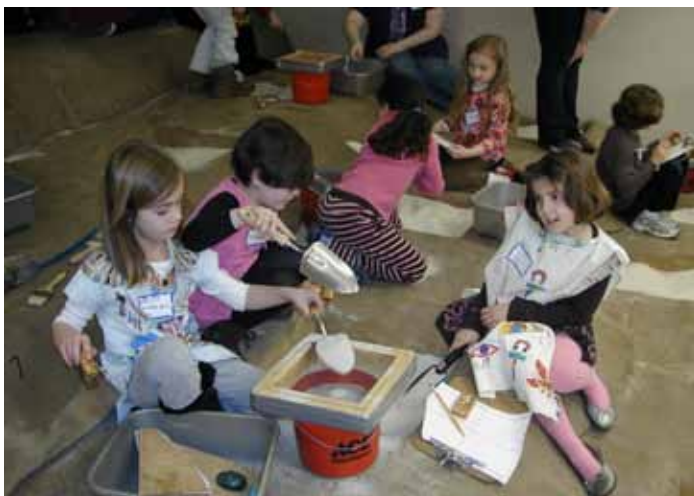
Figure 5. Celebrating her seventh birthday at the KADC, the birthday girl (lower right) enjoys watching her friends intently engaged in the excavation process.