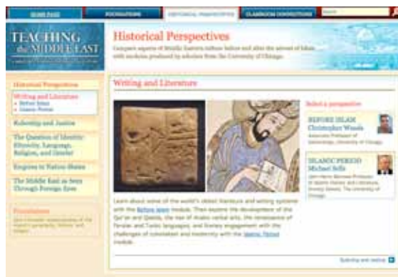
Figure 2. Historic Perspectives Web page from the NEH Teaching the Middle East: A Resource for High School Educators Web site

Teaching the Middle East's extraordinary partnership, which combines the expertise of scholars, teachers, public-programs specialists, and technology professionals, is already attracting attention from educational organizations across the county. The project's unique resources will soon be available nationwide to enrich teaching and learning about the Middle East for many years to come.