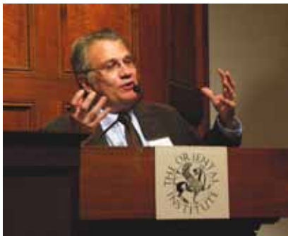
Figure 10. Carlos Tortolero, President of Chicago's National Museum of Mexican Art, summarizes his views on "Who Owns the Past?" during the public forum that invited Chicago archaeologists and museum leaders to share their opinions on this issue.