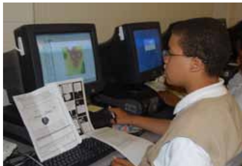
Figure 8. A Claremont Math and Science Academy student in the school’s computer laboratory uses specially designed, student-friendly GIS distributional analysis worksheets to hypothesize the location of the “rare medallion” during the Museum Connections program supported by the Chicago Public Schools.

guide archaeological study of the past. This approach fit perfectly with Claremont’s goal to integrate technology into their curriculum, especially for the sixth grade, where teachers had planned to introduce Geographic Information Systems (GIS) into studies of the ancient world and earth science. Their objective was to put students’ interest in technology to work in ways that would inspire development of critical and intellectual skills in science, social science, math, and computing, helping prepare students for high school, college, and employment.