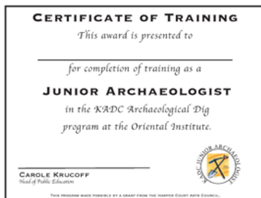
Figure 3. Students who took part in the Kipper Family Archaeology Discovery Center program supported by the Harper Court Arts Council had their name inscribed on this award certifying them as a Junior Archaeologist