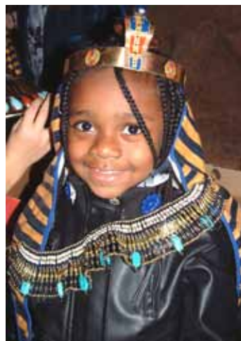
Figure 19. A young visitor is all smiles after dressing up in items from “King Tut’s Closet” during Mummies Night, our annual pre-Halloween celebration for families.

The KADC was the site of two family events this past year — the sold-out “Dig It” program and the very successful birthday-party pilot. And visitors at the Museum took home 11,816 of our bilingual Family Activity Cards — an increase of 9.5 percent over last year. But it was our mummies who took center stage with the family audience when we hosted Mummies Night in October. This pre-Halloween event, which was offered in collaboration with the city’s celebration of “Chicagoween” and Chicago Book Month, has become an annual tradition. Mummies Night featured a showing of “Mummies Made in Egypt,” an animated and live-action film from the award-winning Reading Rainbow series. Docents and interns also offered a “tomb-full” of activities that ranged from folding origami pyramids, bats, and frogs, to dressing up in costumes from “King Tut’s Closet” (fig. 19) to a “Guess the Mummy Lollipops” contest. Mummies Night attracted more than 550 parents and children this year, the largest attendance ever for this highly popular event.