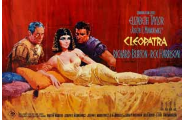
Figure 9. Filmgoers at our Sunday film series enjoyed a spectacular cinema epic when we screened the 1963 version of Cleopatra during Women’s History Month in March

Empowering teachers to enrich student learning through meaningful study of ancient civilization is also central to the mission of Public Education. Grant-funded support is the vital foundation that enables us to provide innovative and in-depth on site and online learning experiences for teachers and their students. This year we completed two major grant-funded multi-year initiatives and received support for two new projects. All are helping us reach teachers and students in ways that will be meaningful and beneficial well into the future.