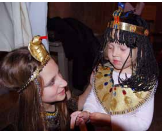
Figure 24. Adults as well as children enjoyed dressing up in items from “King Tut’s Closet” during Mummies Night, our annual pre-Halloween celebration for families.

The KADC was the site of a family event this past year — the sold-out Neighborhood Adventures program. And visitors to the museum took home 13,480 of our bilingual Family Activity Cards, a 14 percent increase over last year. But once again it was mummies who took center stage with the family audience when we hosted our annual “Mummies Night” in October. This pre-Halloween event, which was offered in conjunction with the citywide celebration of “Chicagoween,” featured a “tomb-full” of activities led by docents and interns. These ranged from a “Guess the Mummy Lollipops” contest to dressing up in costumes from “King Tut’s Closet” (fig. 24), and from folding origami pyramids, bats, and frogs to treasure hunts in the Egyptian Gallery. This year, the Membership and Education Offices joined together to