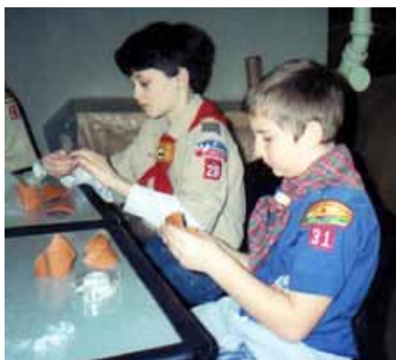
Figure 20. Boy Scouts from Troop 28 intently engage in reconstructing pottery during a KADC program to earn their Archaeology Badge.