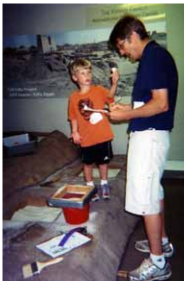
Figure 19. "Dad, look what I found." A father and son team up to excavate and record their discoveries during a KADC program for families as part of the Neighborhood Adventure Series sponsored by the Chicago Office of Tourism.