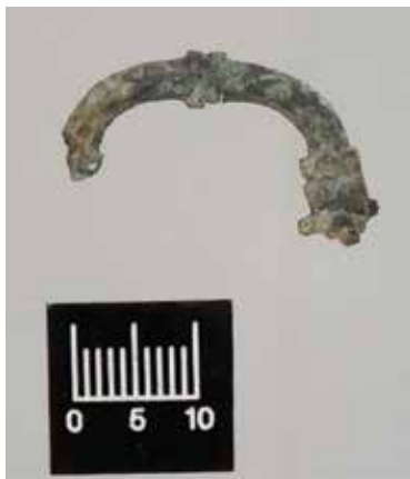
Figure 4. The Phrygian type XII fibula from Trench 31