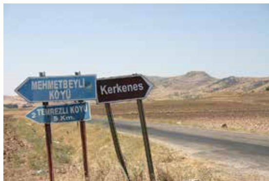
Figure 10. One of the new road signs directing people to Kerkenes Dağ

In addition, we paid to have new directional signs constructed and installed at intersections along the road from Sorgun to replace older signs that had been installed years ago (fig. 10). We also paid to have new signs constructed and installed at the excavation house and at the entrance to the site (fig. 11). These will help welcome visitors to the site and will give them a basic orientation to our past twenty years of work here.