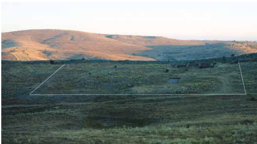
Figure 2. Annotated photograph of the area of Urban Block 8, outlined in white