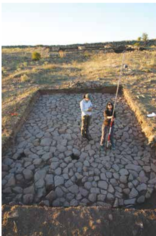
Figure 6. Susan Penacho and Yasemin Özarlan working on photo-recording and planning Trench 33 on the tablet PC

Trench 33, meanwhile, was 5 × 8 m in size and located at a distance of 25 m to the south of Trenches 29 and 31. It was situated to reveal 40 sq. m of the area directly in front of the large columned building in Urban Block 8 (fig. 6). A sloping stone paving was uncovered across the