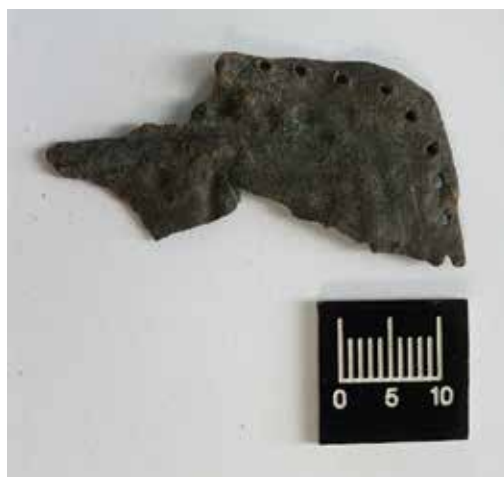
Figure 7. Corner of a bronze plaque found in Trench 33

entire area, and six potential postholes in the southern end of the pavement hint that portions of the pavement may have been covered. While there were very few small finds recovered on the pavement, a bent iron nail was found lying in the middle portion of the pavement and a very fragmentary corner of a bronze plaque was found closer to where the doorway of the building would have been (fig. 7).