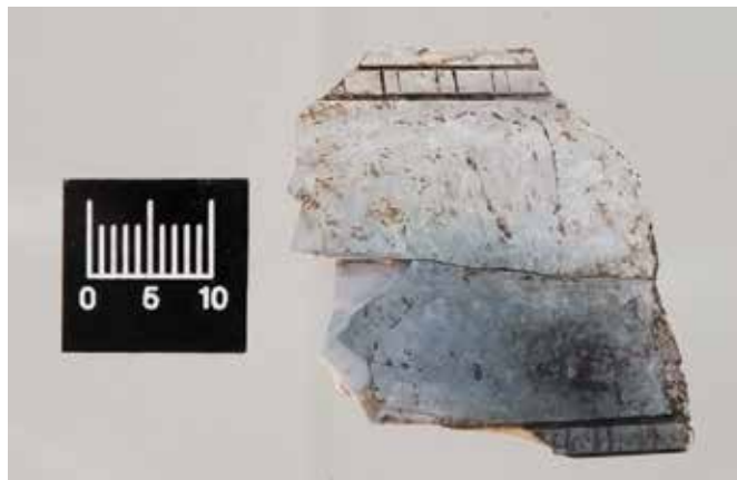
Figure 5. Fragment of carved ivory from in front of Room 5

ture. Could Room 5 perhaps contain an ivory-working area? Or could it be another room to store more prestigious goods? The answers to this puzzle will have to await future excavation.