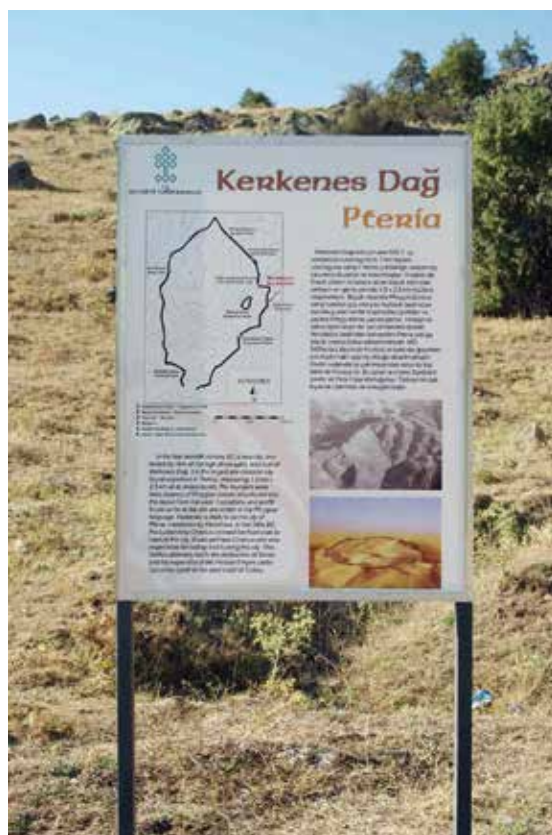
Figure 11. New welcome sign installed at Kerkenes Dağ. This sign highlights our past twenty years of research and excavation