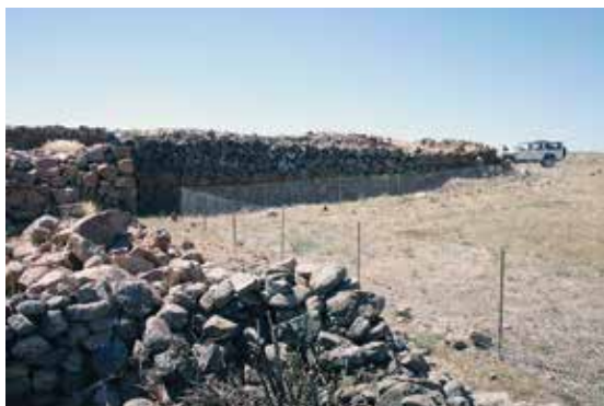
Figure 9. New fencing erected around the Cappadocia Gate