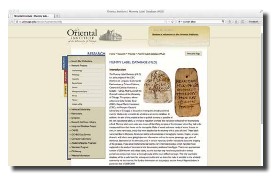
Figure 2. The homepage of the Oriental Institute website dedicated to the Mummy Label Database

As for the Oriental Institute MLD webpage, it includes a description of the project as well as downloadable PDF documents of all the MLD annual reports since 2008–2009. Both websites and the database will be updated on an ongoing basis. Moreover, our aim is to have a preliminary version of the database, with approximately five hundred items, uploaded by the end of October 2013.