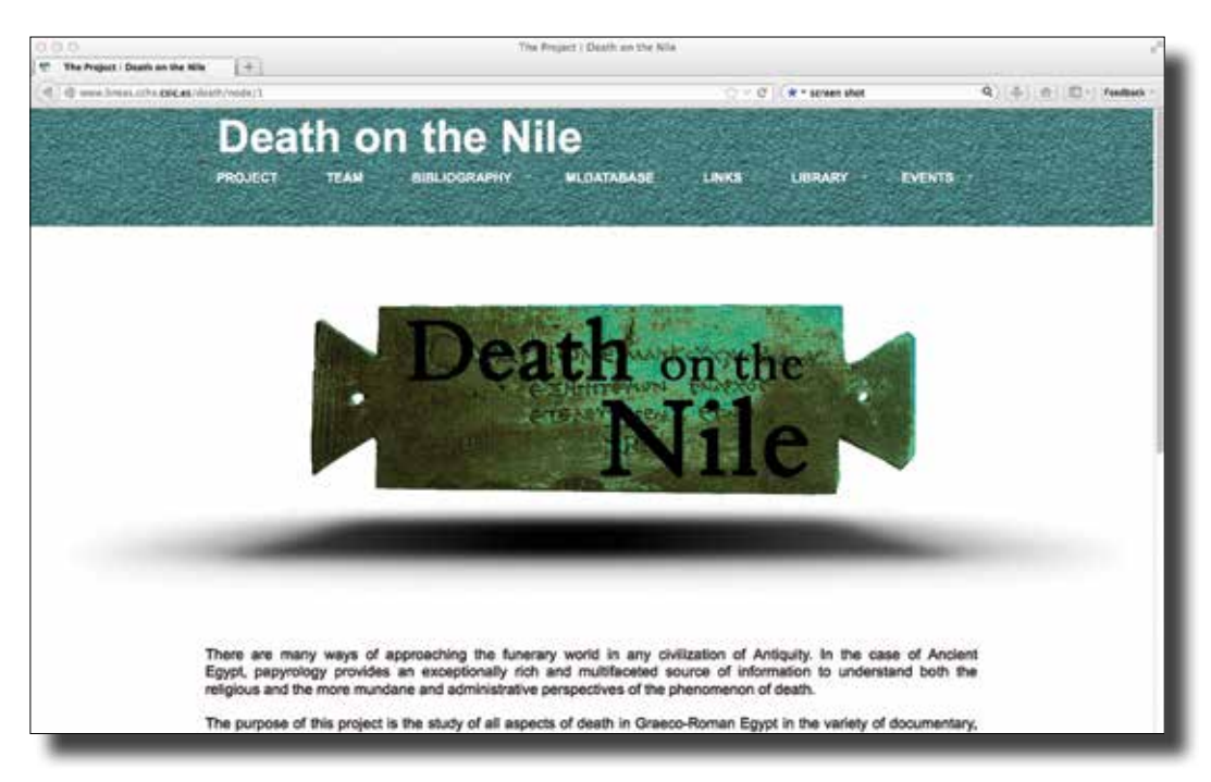
Figure 1. The homepage of the CSIC website dedicated to the project Death on the Nile, hosting the Mummy Label Database

http://www.proyectos.cchs.csic.es/death/node/1 http://oi.uchicago.edu/research/projects/mld/