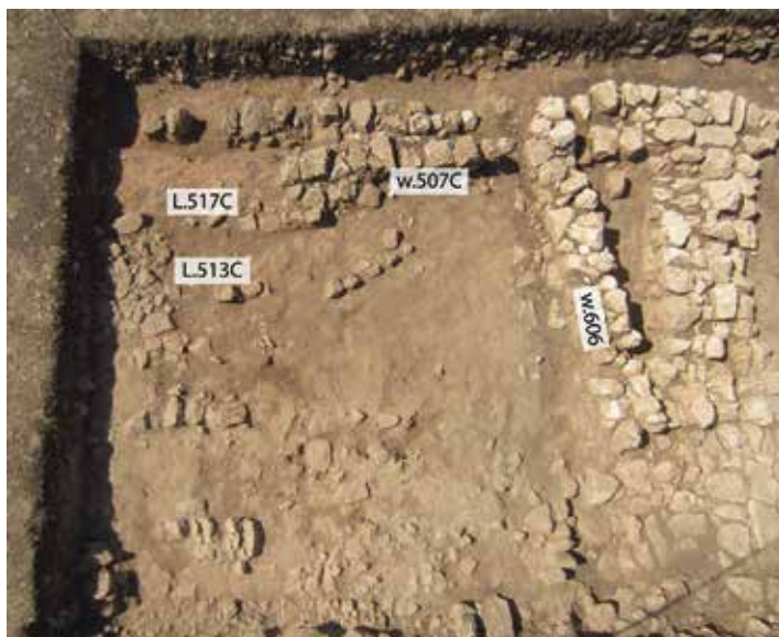
Figure 5. Area CC, end-of-season overhead view

The preservation of these features near the ground surface slowed excavation in Area CC, but also hinted at the potential for greater preservation at deeper levels. We will focus on this area during the 2013 season in the hopes of gaining an understanding of the architectural features and their stratigraphic relationships.