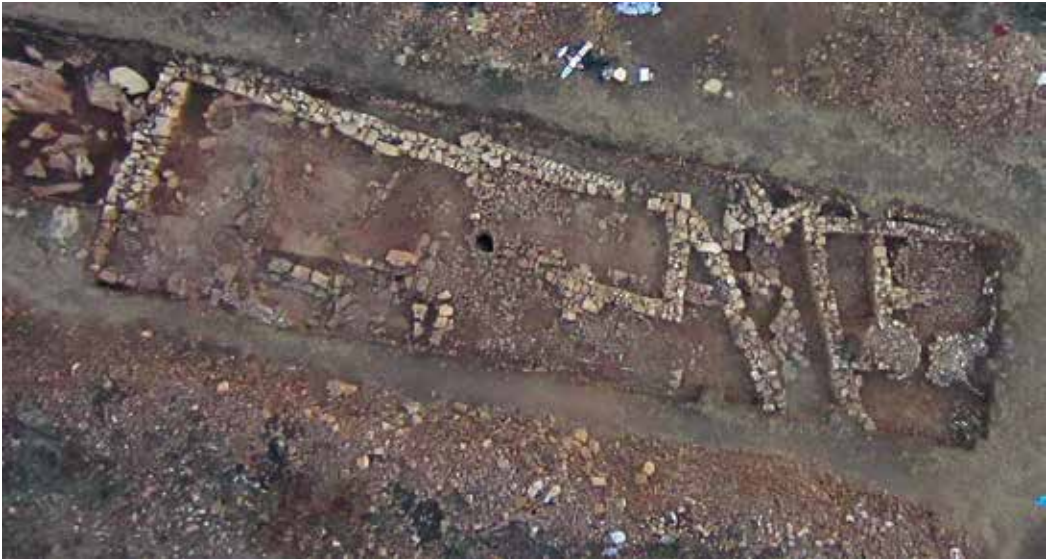
Figure 2. Aerial view of Areas AA and BB, taken from the quadcopter

order to expose the earlier strata of architecture and hopefully contemporaneous features and surfaces.