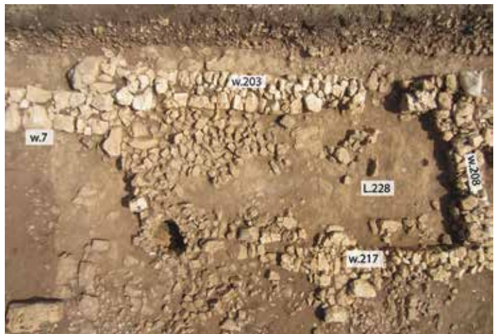
Figure 3. Aerial view of room and floor in Area AA, after removal of circular stone features

In 2011, we sectioned an additional stone circular feature (L.207), removing half down to the floor level of the earlier room in squares F1 and E1. This season we carefully removed the other half, which suggested that there was mudbrick deposited below the feature before the stone circle was constructed. In several excavation steps, we eventually lowered this area to the associated room floor (fig. 3), indicated by the pottery found lying flat in the surface.