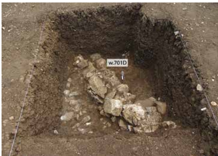
Figure 6. Area DD, view of wall w.701D

Excavations carried out during summer 2013 will mark the end of investigations at the site of Marj Rabba. There are still a number of questions that we need to answer, and these will be the focus of our inquiry during July and August of 2013. We will focus efforts in Areas AA, BB, and CC on clarifying stratigraphic relationships and phasing of the site. In addition, we hope to excavate the site to bedrock, at least in some places, in order to understand a full stratigraphic development of the preserved strata. Our program of intensive recovery of paleobotanical remains and flotation will continue in the hopes of more conclusive evidence for the types of plants being exploited in the area. We will also complete the extensive survey of the area, intensively field-walking two areas skipped in the 2011 pedestrian survey.