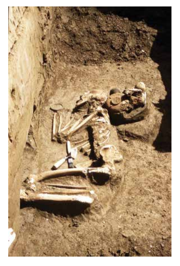
Inanna Temple, (right) Tomb 7 B 7, and (below) its contents