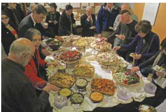
Guests enjoy a feast in remembrance of Katumuwa prepared for them for the In Remembrance of Me exhibition members' preview