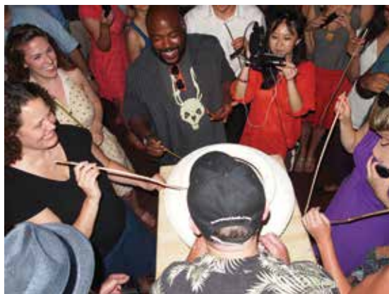
Guests enjoy communally sipping Sumerian beer at A Toast to Ninkasi