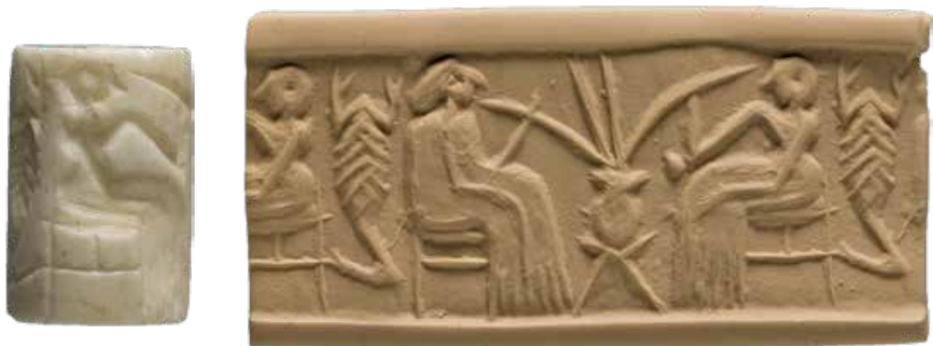
Overleaf: Modern impression of a cylinder seal showing a beer-drinking scene; (above) White stone cylinder seal and modern impression. Early Dynastic period, ca. 2750–2330 BC. Iraq, Khafajah, found in a robbers' hole. Excavated by the Oriental Institute, 1932/1933. 2.1 × 1.3 cm. OIM A11464. D. 027514.