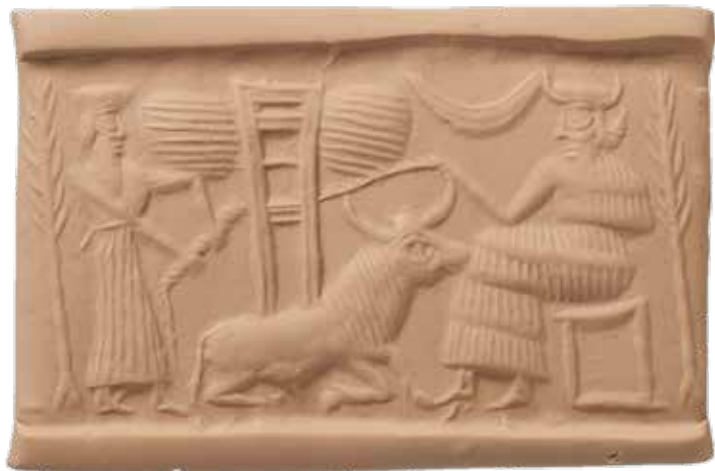
Overleaf: Modern impression of a seal showing a goddess at the gate and the bull of heaven; before the goddess is a deeply cut crescent and behind her a palm tree; over the bull is a gate; (above) Serpentine cylinder seal with modern impression. Early Dynastic-Akkadian, ca. 2900–2150 BC. Iraq, Kish, Mound III, Level 2, Grave 4. 3.3 × 2.1 cm. OIM A535. D. 019007.