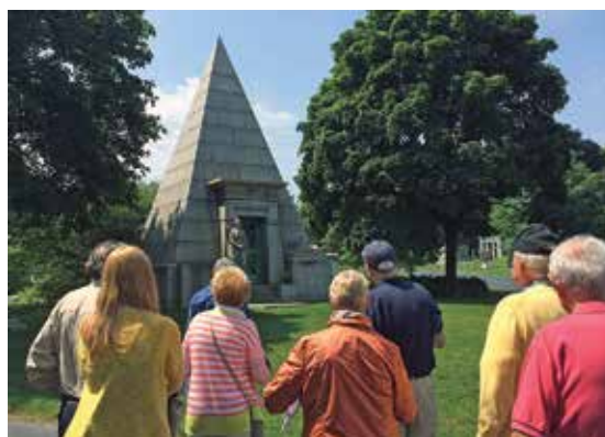
Figure 9. Graceland Cemetery Walk