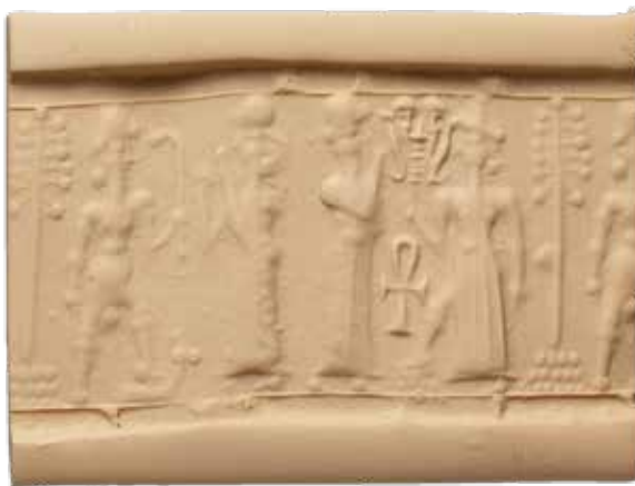
Overleaf: Modern cylinder seal impression; (above) Hematite cylinder seal with modern impression. Mitanni period, 1600–1500 BC. Turkey, Tell Tayinat. Excavated by the Syrian Expedition of the University of Chicago, 1936. 2.1 × 1.1 cm. OIM A27494. D. 009194.