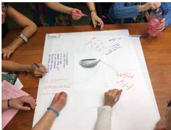
Figure 18. Teachers participated in a lesson planning activity at one of our Teacher Workshops

Additionally, this year we partnered with the Chicago Public Schools, Department of Literacy for the Social Science Academy, which was a year-long professional development program for classroom teachers. Through this program, three Chicago Public School teachers, from Orr Academy High