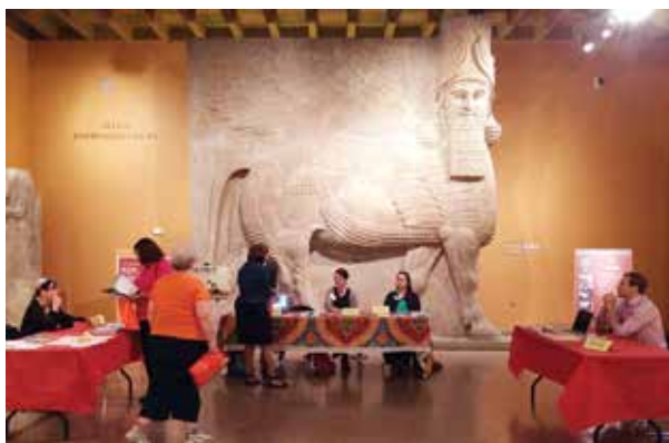
Figure 15. Representatives of the UChicago K-12 outreach offices participated in the Oriental Institute's first annual Teacher Appreciation Night in May 2013