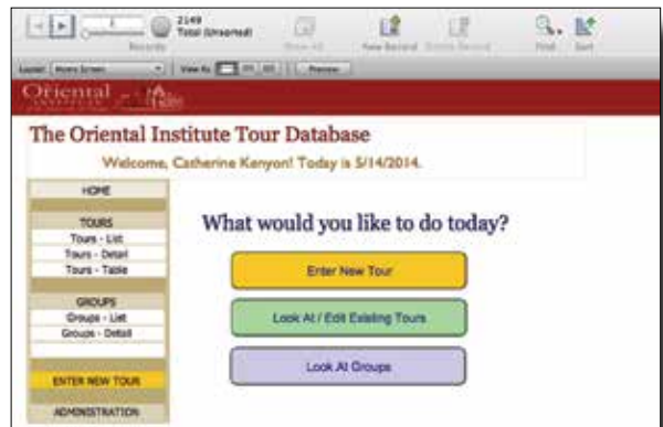
Figure 5. The new Education Department FileMaker Pro tour database

This year we had a number of opportunities to bring the Oriental Institute into public and professional communities. We even reached the international community. This outreach included professional presentations at the University of Chicago's Faculty Technology Day, CPS Social Science Meeting, Computer Applications and Quantitative Methods Conference (CAA) in Paris (fig. 7), public speaking engagements for Montgomery Place Assisted Living Community, DePaul University business school students, Dominican University art history students, Chicago Volunteer Expo and public programs with the Assyrian Community,