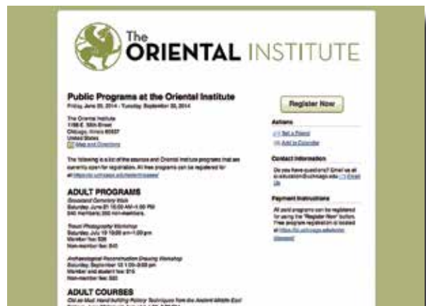
Figure 6. Oriental Institute public programs online registration page — what the public sees