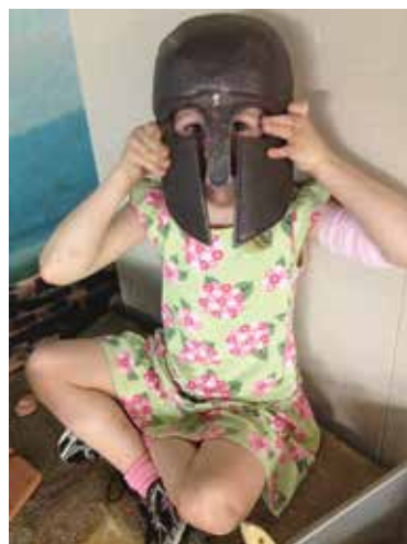
Figure 10. Kids and parents have fun digging up artifact replicas during the Junior Archaeologist program

Over 200 people came to the day-long bird-themed family event Open Nest , offered in conjunction with the special exhibit Between Heaven & Earth: Birds in Ancient Egypt . Among the many activities this final event for the exhibit offered, it invited families to make a bird-version of themselves and learn the staff-parody "The History of the Chicken" Dance about the origin of the chicken and its travels from Asia to Egypt (fig. 11, left). The Oriental Institute