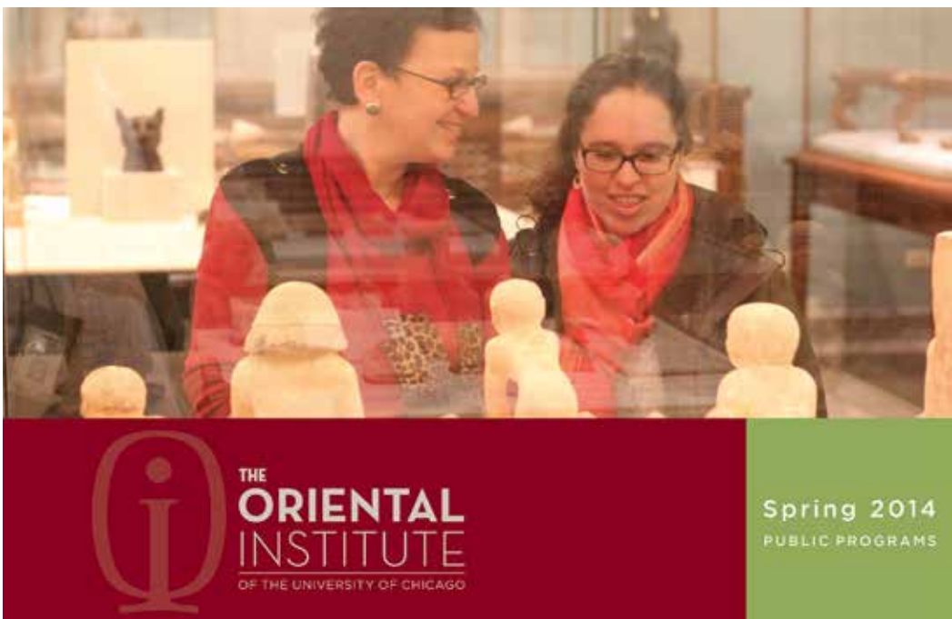
Figure 4. Cover of the spring 2014 public programs brochure

Deciphering the Past: Beginning Egyptian Hieroglyphs. This fiscal year saw the development, production, and launch of a whole new online course — a language course. These online courses target an adult audience interested in continuing education and many online classes