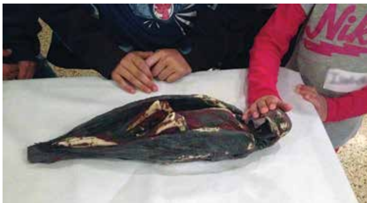
Figure 13. Homeschoolers got to touch a 3-D print of a mummified eagle at Mummy Science

The coming year will see further growth in our homeschool workshops with a focus on building relationships that foster a sense of community. In addition, we will continue to strengthen and grow our current family program offerings.