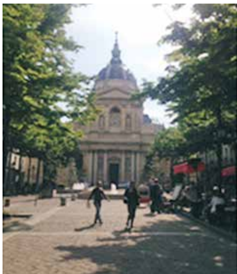
Figure 7. The Sorbonne, Paris, April 2014

Hyde Park Arts Fair, Home School consortiums, and the 57th Street Book Festival.