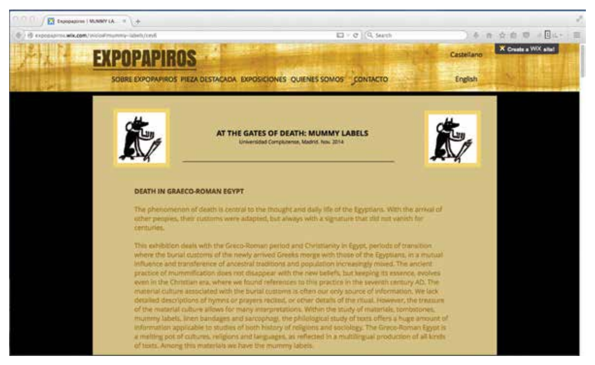
Figure 4. Homepage of the virtual exhibition "At the Gates of Death: Mummy Labels"

http://expopapiros.wix.com/inicio#!mummy-labels/cev6