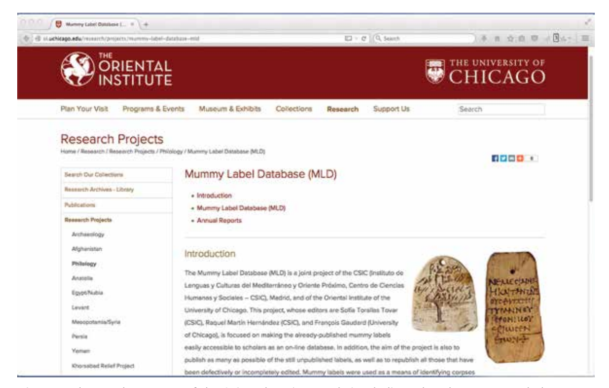
Figure 3. The new homepage of the Oriental Institute website dedicated to the Mummy Label Database