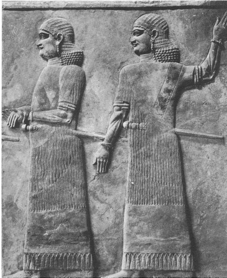
Two Assyrians on relief from palace of Sargon at Khorsabad in Iraq